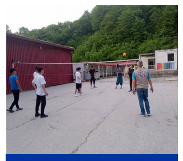
Activities for UASC organized by UNICEF/VVV legal guardians in the UASC Zone