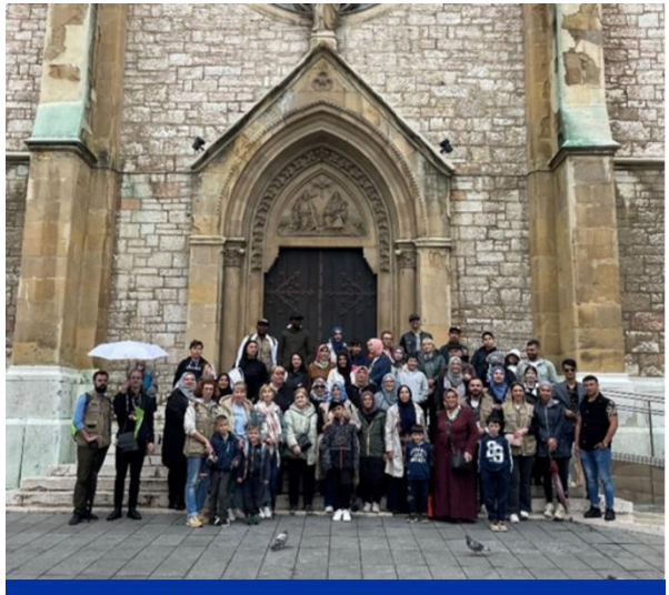
Sightseeing tour of Sarajevo attended by some 50 persons in need of protection