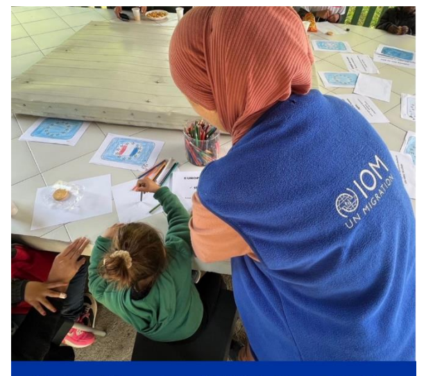
Creative activities organized in TRC Ušivak on the occasion of the Europe Day @IOM 2023

764 Number of services provided by the IOM Mobile Team