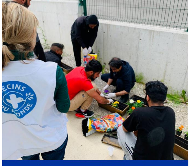
Mental health and wellbeing through outdoor activities @DRC partner MdM 2023