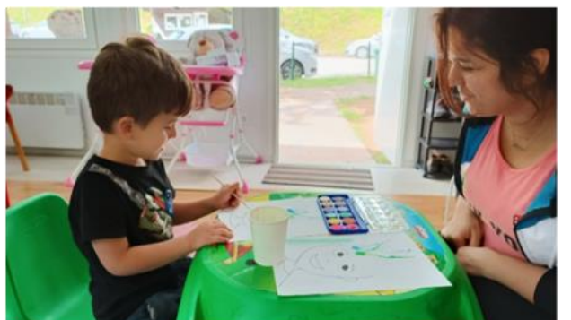
Mother and child activity organized in the Mother and Baby unit in TRC Ušivak

Joint IOM – UNHCR/Vaša prava BiH info session for unaccompanied and separated children