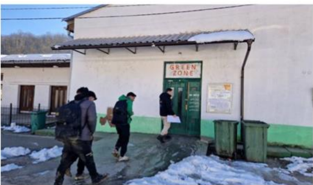
Protection-sensitive accommodation and complementary services for vulnerable young men within the Green zone in TRC Blažuj