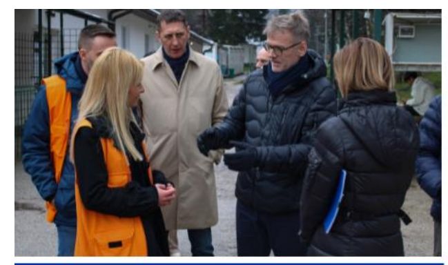
Visit of the Ambassador of Norway to Bosnia and Herzegovina to TRC Ušivak @IOM 2023