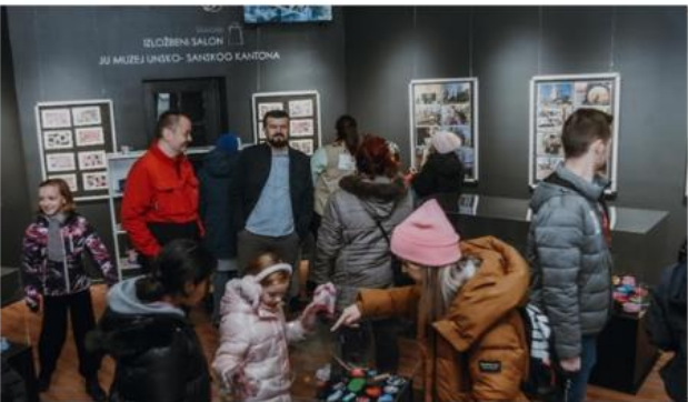
Exhibition of children's works created during the "Winter School" @SCI 2023