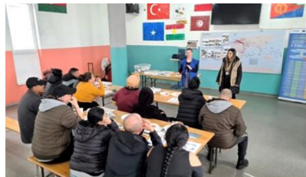
Joint IOM – UNHCR/Vaša prava BiH info session in TRC Borići