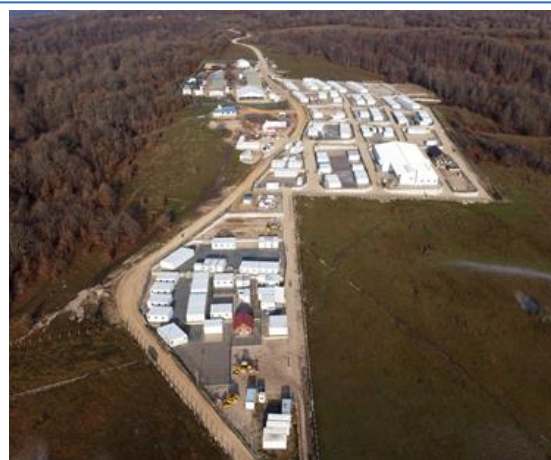
Aerial view of TRC Lipa, opened on 19 November