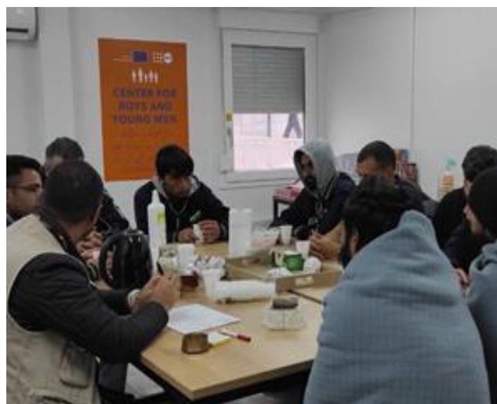
Boys on the Move session in TRC Lipa