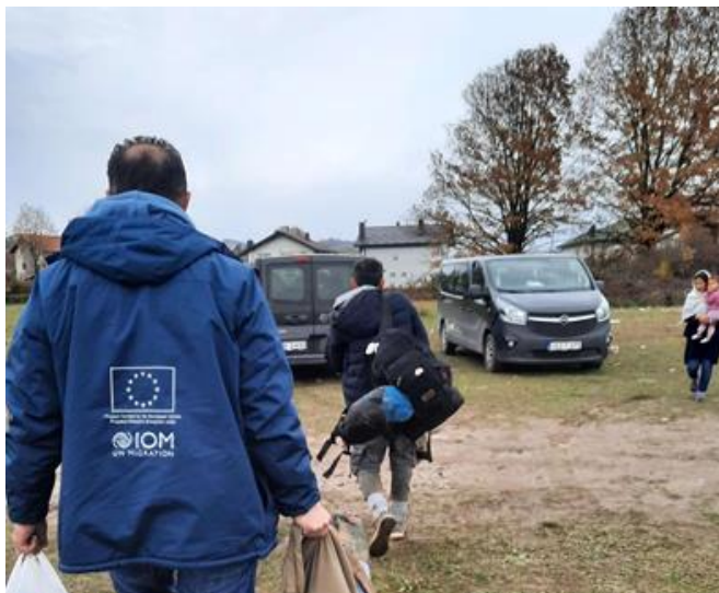
Outreach team in Una-Sana Canton

452 transports carried out for 1,761 migrants and asylum-seekers persons