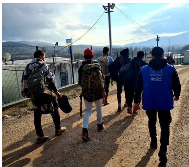
Migrants and asylum-seekers move to newly opened TRC Lipa