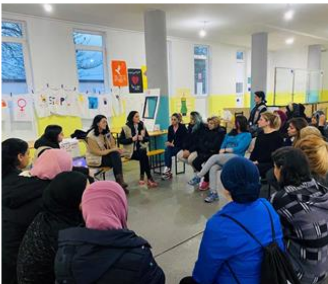
Educating women on GBV in TRC Borići

UNFPA conducted a total of 16 educational activities in the Boys and Young Men Centers in TRCs Miral, Borići and Lipa with 93 participants. Also, a joint UNFPA GBV and SRH educational session “GBV: Institutional and Medical Approach” was organized for 11 females at the Women and Girls Centre in TRC Ušivak, providing women with basic information on treatment and protection. UNFPA in TRC Ušivak also organized an empowerment session for six women on “Mine Danger in BiH”. In November, DRC followed up 37 open cases on weekly basis and provided alternative accommodation for 2 GBV survivors in SC throughout the month.