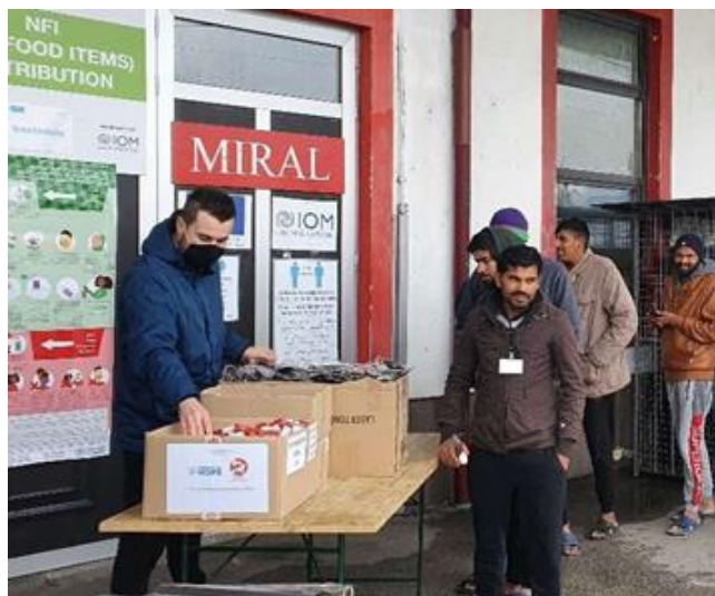
PPE distribution in TRC Miral