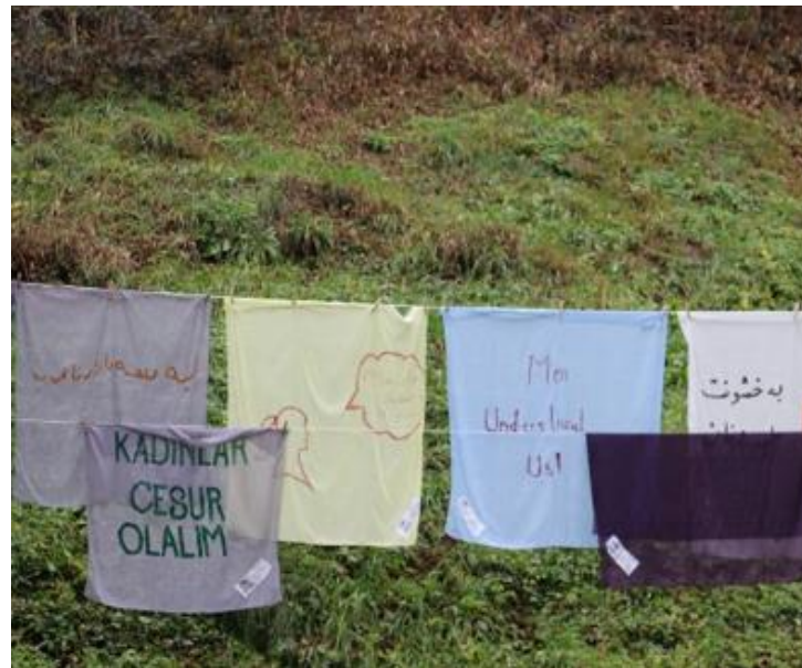
UNHCR and its partner BHRI marked the start of the 16 Days of Activism against GBV with women in TRC Ušivak, who shared their messages to the world on scarfs.

In November, the 16 Days of Activism against Gender-Based Violence (GBV) campaign was kicked off by all United Nations (UN)