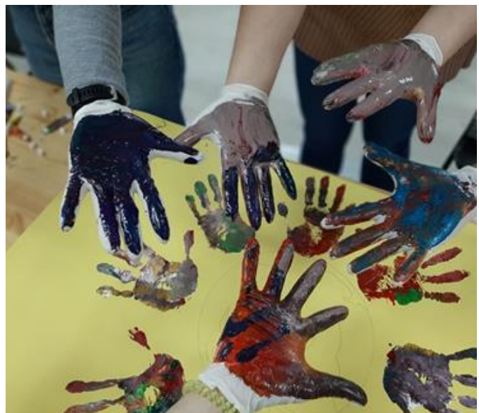
Creative workshop with UASC in TRC Ušivak

54 children were included in the formal education system by UNICEF/SCI in SC.