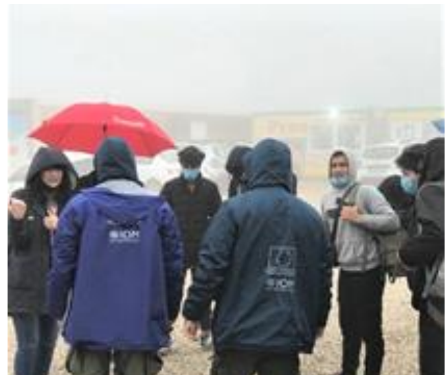
Outreach teams provide transport services for migrants and asylum-seekers