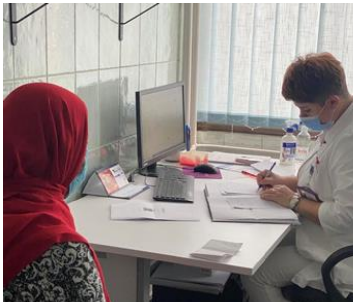
SRH examination in Bihac

Moreover, DRC provided assistance to a total of two pregnant women, whereas 21 SRH related consultations were conducted in the reporting month. Furthermore, one health care visit to PHC and SHC each were realized by DRC.