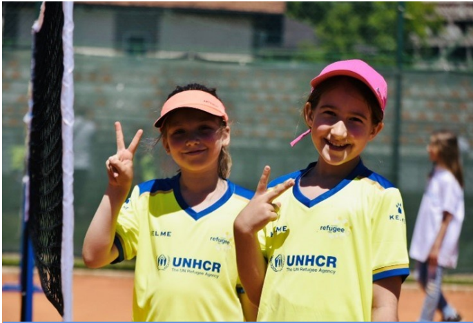
Sports tournament organized by the City of Bihać organized on World Refugee Day