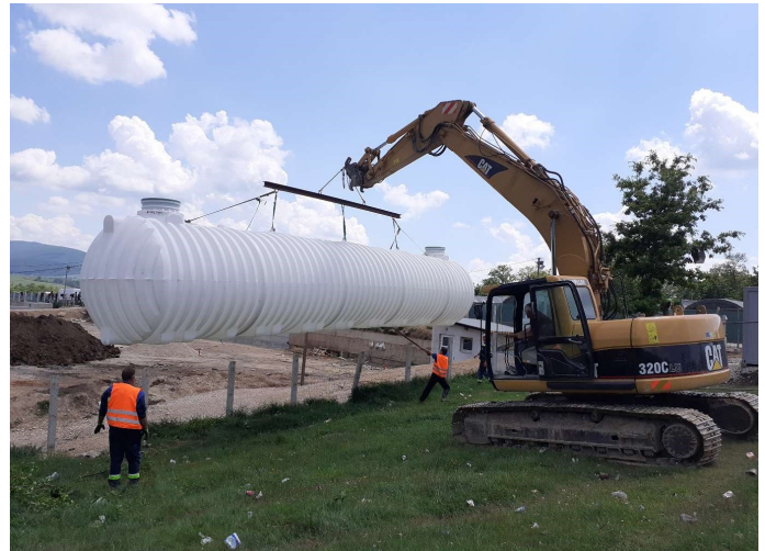
New water tanks installation in TRC Lipa

Regular repairs and replacements include sink faucets, toilet tanks and pipes, shower faucets, flushers and water taps. The five TRCs have functional laundry systems for the washing of bedding/sheets and beneficiaries' clothes. In TRC Borići, painting work were conducted to refresh the area and improve the sanitary conditions of the centre and also contribute to COVID-19 preventive measures, as the paint used is washable and the walls can be disinfected. As such, the walls of the common areas, the corridors and the stairways of all floors, the main hall on the ground floor, including the dining area and the staircase leading to the laundry, and the rooms on the 2nd floor, were finalized in June. Furthermore, as part of the planned renovation works of the floors of all six external sanitary containers, due to their severe deterioration given by humidity and frequent temperature fluctuation, the following works were conducted: all six entrance doors, the laminate floors, the