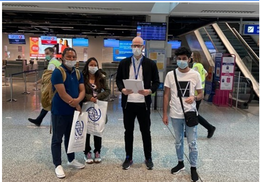
AVRR departures from BiH in June

Furthermore, 2,746 migrants were reached by IOM AVRR outreach staff in BiH (632 in centres and 2,114 outside centres). The Outreach Team was present in TRCs/PC, promoting migrants' rights and informed decision on voluntary return and reintegration options and counselling relevant to their decision. Information also include data on mobility restrictions and can be accessed on web page developed for AVRR information campaign as well as Facebook page Support for Migrants .