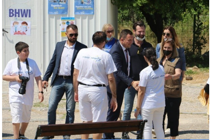
The BiH Minister of Human Rights and Refugees and UNHCR Head visit to the Refugee Reception Center Salakovac

On June 10, the third IOM-SFA joint Displacement Tracking Matrix (DTM) exercise took place, in order to collect information on the number of migrants, asylum-seekers, and refugees present outside reception centres. Estimates of migrants and asylum-seekers outside of formal reception facilities vary. Based on the data collected by IOM and the SFA on June 10, at least 2,591 persons were met in the 113 locations visited in BiH, in six Cantons. Out of which 2,589 indicated they were not staying in an official reception facility.