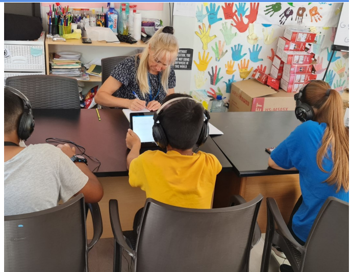
Akelius Digital Language course © UNICEF, World Vision 2021

In USC, SCI continued to support the enrollment of children in formal education in five primary schools in the municipalities of Bihać and Cazin. In June 125 children finished the school year. In collaboration with the Ministry of Education, SCI initiated and organized Summer School activities and sports courses in nature, in which 60 children participated every day. In June, the cantonal education ministry said it will allocate a