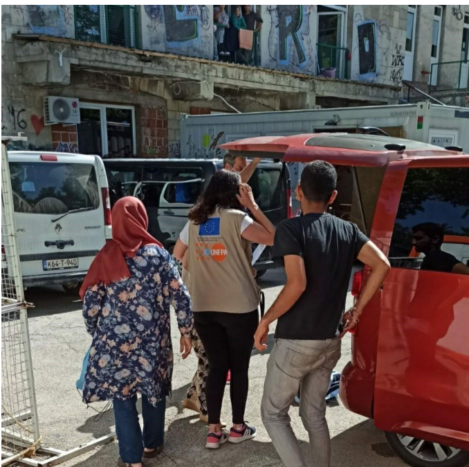
Relocation of beneficiaries from TRC Sedra to Borici

IOM has on-call mobile teams available 24/7 for assistance and transportation of migrants, refugees and asylum-seekers. These include transportation for medical cases to hospitals, for children going to school, for vulnerable and injured persons heading to centres identified by outreach teams, for asylum-seekers going to asylum interviews, and for transfers at the request of the SFA.