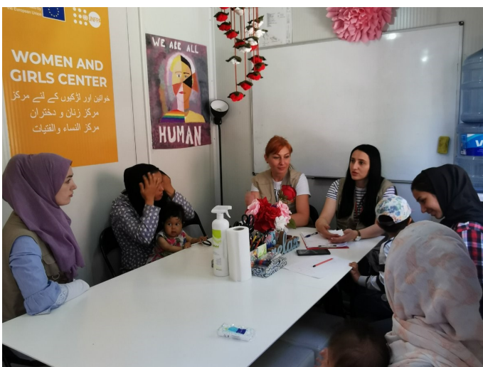
Young Mothers’ Club in TRC Usivak

For instance, in June, migrants and asylum-seekers in all centres were informed on the transition to the Smart Camp Application and the need for new identification cards with QR codes. Notifications were also posted throughout the centres in different languages. Moreover, in TRC Blažuj, Community