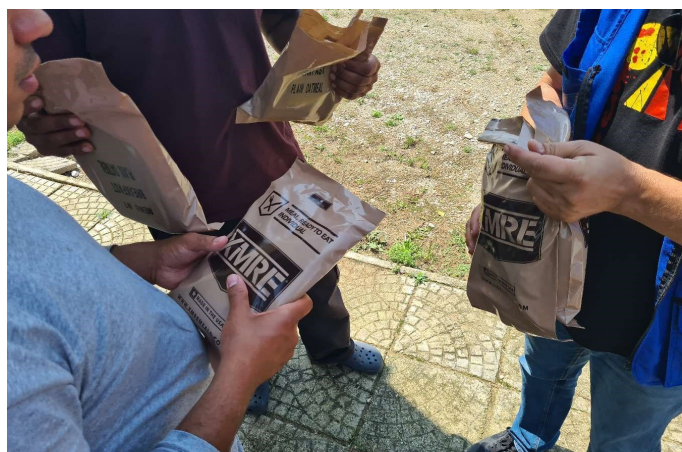
Non-food and Food Items distribution in outreach

IOM provides NFIs for newly arriving migrants, refugees and asylum-seekers in all TRCs. An NFI distribution system is in place and operational with set schedules displaying distribution times. IOM provides NFI welcome kits, after which individual NFIs refills are provided. NFIs include items such as clothing, footwear, hygiene products, clean bed sheets and linen, or other medical cases as per need. NFIs also include packages to hospitalized migrants, refugees and asylum-seekers which contains pyjamas, slippers, a towel and other items necessary for hospital stays. Specially prepared baby packages and other items are available based on needs. All new arrivals in pre-registration or in isolation are provided with hygiene packages (including soap, shampoo, shower gel, toilet paper, tissues) as well as clothes when needed. In June, IOM distributed a total of 38,840 individual items to 2,974 persons. Furthermore, through the Centres for Women and Girls (WGC) and Boys and Young Men Centres (BYMC) , UNFPA continued to distribute modern contraceptives and hygienic products. In June, UNFPA distributed 113 dignity kits and 326 contraceptives for women. In addition, five dignity kits for adolescent boys and around 241 condoms were distributed through Centres for Boys and Young men.