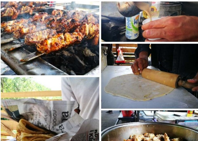
Migrants and asylum-seekers preparing food for World Refugee Day

In June, IOM outreach team distributed 6,114 food packages to migrants and asylum seekers sleeping rough outside the centres. Furthermore, IOM outreach team also provided food packages to SFA at PC Lipa, for migrants arriving during night, based on the needs. In addition to the above, the IOM/Red Cross outreach team also provided a total of 329 loaves of bread, 76 flatbreads, as well as 21 crates of apples, 21 of oranges, 15 of pears, four of bananas and one crate of peaches from TRCs Sedra to migrants residing in outside locations, with particular attention to families with children. DRC outreach teams also provided regular assistance to migrants and asylum-seekers in outreach locations with the provision of energy-saving food and NFI assistance. A total of 8,478 assistances were provided during the month of June.