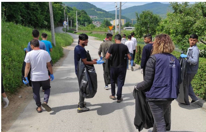
Collective cleaning action with migrants in TRC Ušivak

moldings, and the toilet seats were replaced, while ten cabinet doors were rebuilt and repositioned. In addition, several sanitary were repaired or completely replaced. During the reporting period, two sanitary containers (each with three toilets and two showers) were donated by L'ERA (Evandeoska Razvojna Agencija - Evangelical Relief Agency) for the new TRC Lipa.