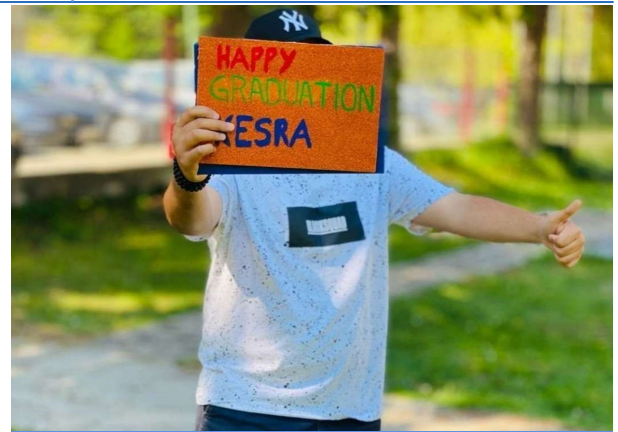
First ever migrant and asylum-seeker child to complete primary school education in BiH, TRC Sedra