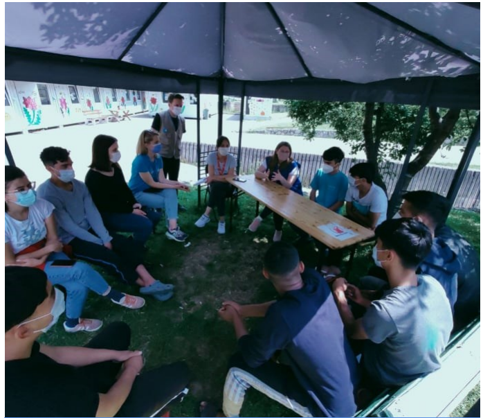
Boys Parliament meeting in TRC Sedra

Representatives were informed about new services that will