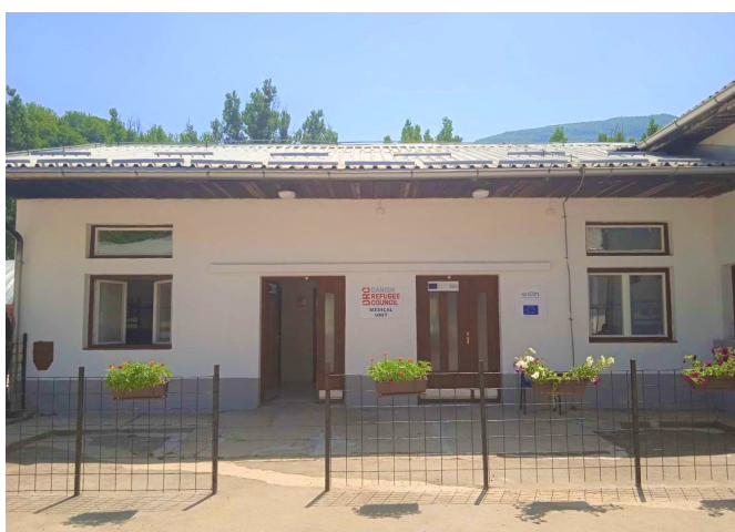
Renovation of the medical unit in TRC Blažuj

TRC Blažuj (opened in December 2019) IOM built a fence around the outdoor kitchen with boards that had previously been delivered to the centre: on the left side of the outdoor kitchen a safety net was installed along the height of the kitchen up to the ceiling, so that migrants do not throw waste over