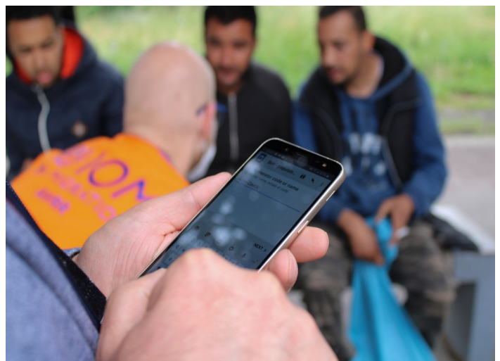
Displacement Tracking Matrix data collection exercise by IOM and SFA on the migrant's presence in BiH

Lastly, on June 30, the closure of TRC Sedra was formalized with the transfer of the migrants and asylum-seekers who were still accommodated in Sedra to TRC Borići. The transfer of IOM, UNHCR and partner agencies assets started accordingly.