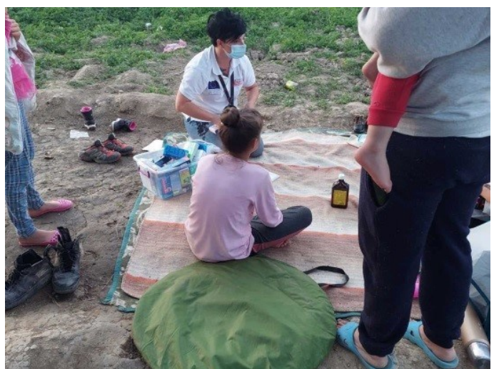
Paediatric services to children outside TRC

Six Red Cross Mobile Teams in partnership with DRC continued implementing outreach health activities, primarily in enhancing the provision of first aid and strengthening the referral process towards public health institutions. In June, they assisted 991 individuals through 793 first aid assistances and 504 psychosocial support (PSS) first aid consultations.