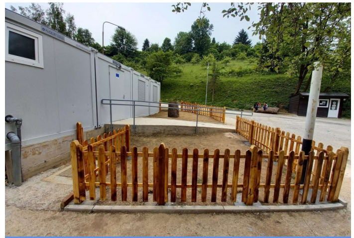
Installation of a protective fence around the IOM Mother and Baby WASH Unit in TRC Usivak

A small incident occurred in TRC Blažuj, where about 30 migrants physically attacked another migrant and accused him of theft. IOM intervened immediately, along with the security guards and the police who was informed accordingly. The fight ended with the migrants being re-escorted to his accommodation.