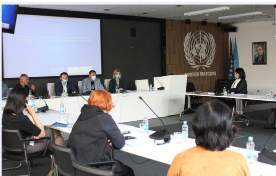
High-level meeting led by IOM held on 15 June with the Service for Foreigners' Affairs, the United Nations in BiH and NGOs

On 31 May 31 and 1 June, IOM and the Ministry of Security (MoS) in Bosnia and Herzegovina (BiH), together with the Service for Foreigners' Affairs (SFA) and the Delegation of the European Union (EUD) in BiH, organized a two-day seminar in Bihac. In addition to presenting the latest mobility trends in the country, with a focus on UASC, partners discussed the key activities needed in and out of transit centres, to ensure safe, orderly and humane migration management, and provide protection and assistance to vulnerable migrants. As a result, a joint follow-up seminar was organized on 15 June, during which a roadmap towards increased State ownership of the migration response in BiH was presented with IOM, the SFA, the United Nations (UN) and partners of non-governmental organizations (NGOs) involved in the humanitarian response. IOM also presented a draft harmonized organizational structure, with responsibility for the new temporary reception centre (TRC) Lipa facility, which will serve as a blueprint for other TRCs in the country.