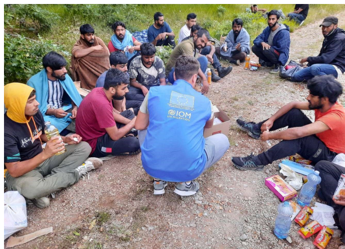
Non-food and Food Items distribution in outreach

In TRC Borići: 10 bags of used clothing by a private citizen; hygiene packages by DRC; three bicycles for children by a private individual; 780 pairs of socks for children and adults