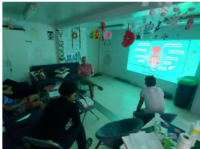
SRH session with adolescent boys

In June, a steady high rate of turnovers, the closure of TRC Sedra and following relocation of persons in need from increased the need for individual PSS sessions. As such, UNFPA conducted 171 MHPSS individual sessions, including for five girls, addressing sleeping disorders, nightmares, and somatic pain due to traumatic experiences and distress given by the relocation. In addition, UNFPA organized 11 group PSS activities with 80 women and girls aimed at improving mental health, especially for women who have never had access to such services. Additionally, UNFPA MHPSS experts provided 34 interventions in crisis situations, mostly given by the impact of their attempt to cross the border to the EU. Also, UNFPA MHPSS staff identified and referred six women for essential psychiatric services, after which they continued to be actively monitored.