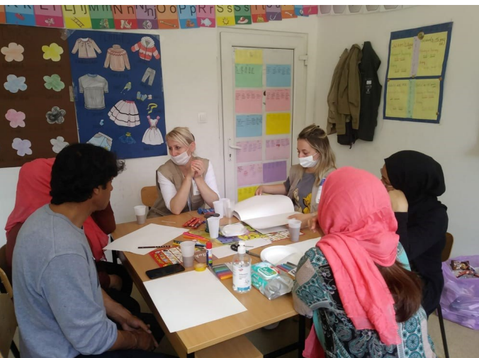
Workshop with parents

On June 26, a group of children accompanied by their parents and IOM Cultural Mediator participated together with children of BiH, in a music workshop organized by the War Childhood Museum and in coordination with Musicians Without Borders.