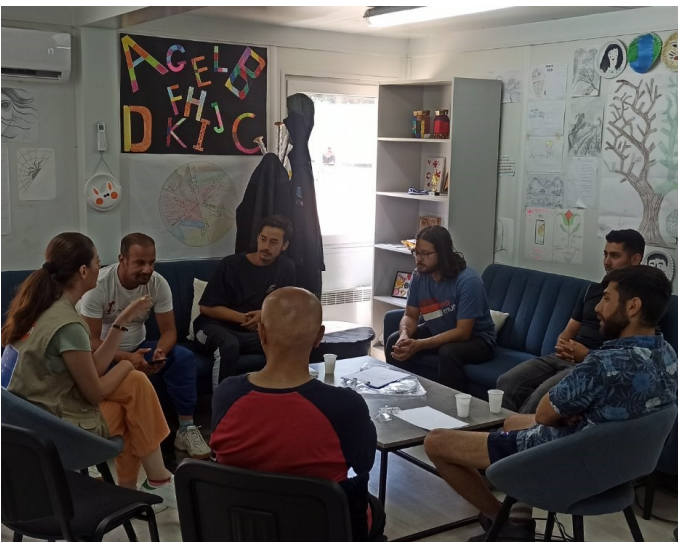
Education session on GBV with adult men

The Danish Refugee Council (DRC) Protection teams daily compiled protection incident reports, providing inputs on violent pushback cases at the Croatian border.