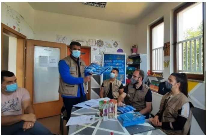
Peer-to-Peer education sessions on asylum procedure in MFS-EMMAUS

Following the complaint sent by UNHCR partner Vaša Prava