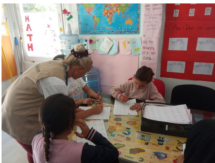
Child friendly space in TRC Borići

During September CWS guardians in Bihać provided 439 services to UASC identified outside of the centres: 188 individual information sharing (on government decisions, COVID-19 measures and protection) and 251 referrals (medical/health, child protection, legal assistance shelter, NFI and so on). For 25 UASC identified outside of the official reception centres and in Provisional Camp (PC) Lipa by the SFA, a CWS guardians provided escort to Emmaus centre in Doboj Istok, and two UASC were accommodated in TRC Miral. During September, the UNFPA Boys and Young Men Centre (BYMC) team in TRC Ušivak included seven adolescents from Sierra Leone in their empowerment sessions. Considering reduced possibility of communication with their peers, special attention was paid to their socialization through improving communication skills.