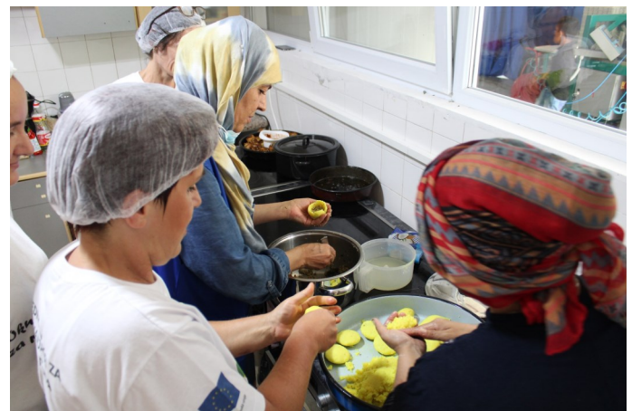
Food preparation in community kitchen in Una-Sana Canton