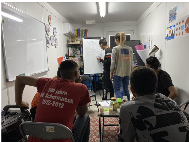
GBV sessions in TRC Miral

In the reporting month, UNFPA organized GBV Working Group for humanitarian actors engaged in Sarajevo Canton. Challenges, trends and achievements have been discussed and further steps, including continuation of GBV trainings organized by UNFPA have been agreed. In September, UNFPA identified 61 new GBV cases of which 35 cases are within the female population while 26 survivors are men, showing an increase in cases from male population compared to previous months. The reported GBV cases mainly involved survivors being subjected to physical and psychological/emotional abuse, but also sexual violence and rape. The total number of GBV cases followed up is 108 (including two cases accommodated in Safe House). Also, 45 cases were closed due to longer inactivity and protracted absence from TRCs. Additionally, UNFPA created eight work plans and eight safety plans to increase survivor's sense of security and to meet the distinct needs. During the group sessions held by UNFPA GBV Case Manager, five single women addressed the lack of privacy and safety during use of toilets and showers in TRC Borici. UNFPA jointly with IOM provided visible door markings, additionally residents were advised on compliance with house rules and rules of using common premises.