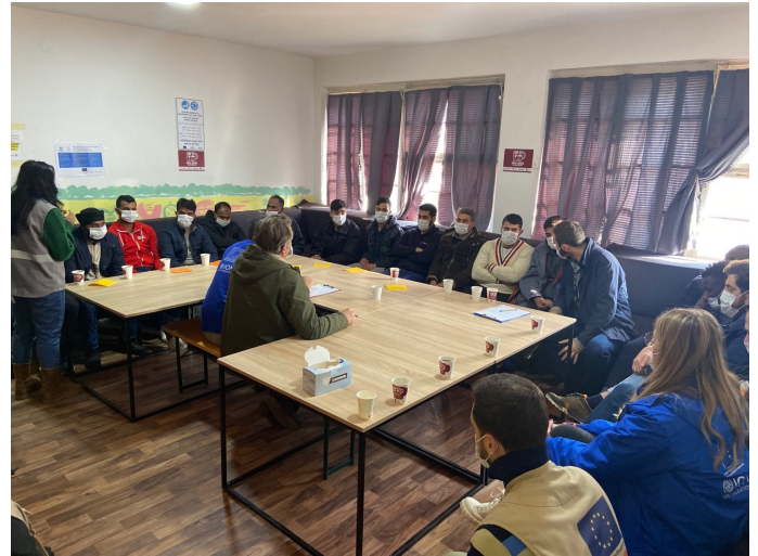
Community Representative Council in TRC Blažuj

IOM encourages the centre population to play an active role in decision-making process and activities that affect them. TRCs have Community Representative Councils and regular meetings are organized by IOM with partner agencies. These serve as a platform for discussion of TRC issues, conflict prevention and resolution, dialogues between different migrant groups and between the centre population and centre management. For instance, in TRC Miral, IOM held a brief informative meeting with migrants on the use of community kitchen. They were reiterated that the kitchen must be cleaned daily