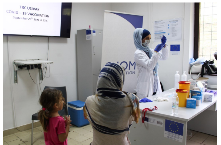
Vaccination organized in TRCs for all migrants

During the month of September, several vaccination and COVID-19 information sessions were organized in TRCs in BiH thanks to the joint efforts of the SFA, IOM, the Danish Refugee Council (DRC), World Health Organization (WHO), and partners to inform migrants and asylum-seekers of the option of being vaccinated in the country. In this regard, on 29 September, the first session of COVID-19 vaccination started where a total of 54 migrants from TRC Ušivak received the first dose of the, in TRC Blažuj, a total of 242 migrants received the first dose and in Una-Sana Canton (USC), 157 migrants have been vaccinated. Moreover, on 30 September, UNHCR and Bosnia and Herzegovina Women Initiative (BHWI) supported the re-vaccination of four migrants residing in private accommodation and an additional two persons who received their first dose. At the end of the month total of 450 migrants were vaccinated with first dose of Astra Zeneca vaccine in BiH.