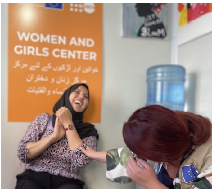
Individual psychosocial sessions with residents in TRC Borići

UNFPA MHPSS experts intervened in 20 crisis situations recognizing specific cases of woman's inability to cope with current overwhelming difficulties including support and assistance to survivor of attempted rape. In addition, UNFPA MHPSS experts identified and referred nine women for essential psychiatric services. UNICEF/MdM teams provided 31 individual psychological counselling sessions and organized 20 group sessions for a total of 32 children. UNICEF/MDM psychologists attended one case conference and implemented four informative consultations with parents regarding their children. Following up on the focus groups with parents organized in TRC Borići during the previous month, and with the aim to identify specific needs and interests relevant to them, UNICEF/MdM team implemented three workshops