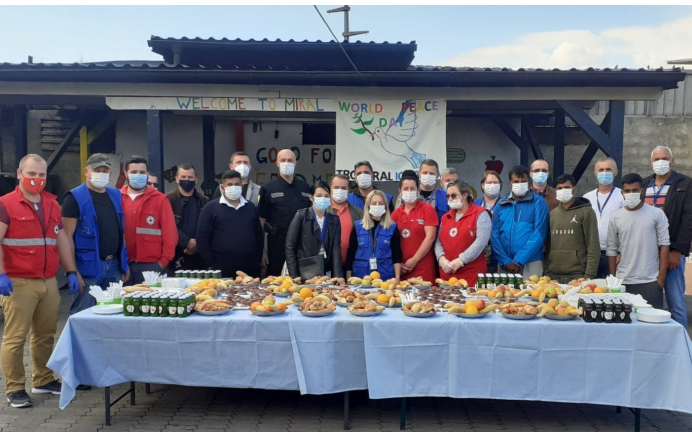
Celebration of International Peace Day in TRC Miral

On 20 September, UNHCR organized a roundtable related to the draft amendments to the Bylaw on asylum. The focus of this roundtable was to address the main gaps in existing asylum legislation. The round table was organized within the Instrument for Pre-Accession (IPA) II project “Regional Support to Migration Management in the Western Balkans and Turkey, Phase II” in the context of UNHCR’s effort to support the BiH asylum authorities to fulfil BiH’s pledge to improve asylum legislation.