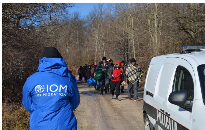
Ensured safe transfer for migrants in different locations