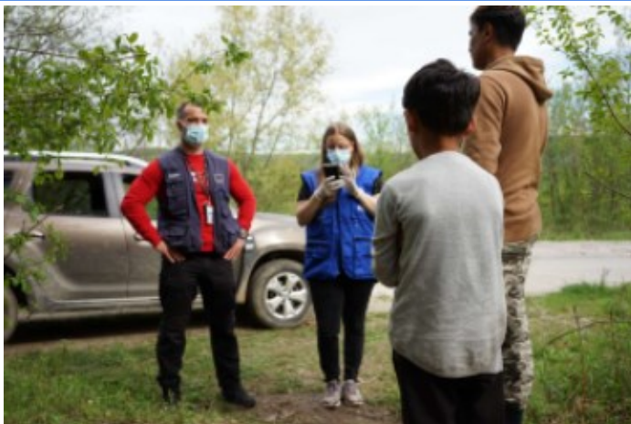
Transportation for migrants provided by IOM © IOM 2021

IOM has on-call mobile teams available 24/7 for assistance and transportation of migrants, refugees and asylum-seekers. These include transportation for medical cases to hospitals, for children going to school, for vulnerable and injured persons heading to centres identified by outreach teams, for asylum-seekers going to asylum interviews, and for transfers at the request of the SFA. In September, the transports organized, in both USC and SC, included 257 to medical facilities, 24 to SFA, 34 for education purposes, 31 outreach and 89 others (which also includes transports between TRCs). In addition to that, the IOM outreach teams carried out 507 transports for 1948 migrants and asylum seekers.