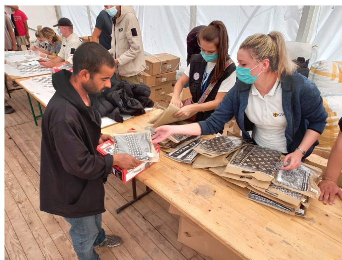
Non-food distribution

In TRC Miral: 544 metal spoons were donated by the BiH RC.