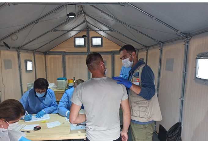
UNFPA team provide vaccination assistance in TRC Blažuj

In September, 3,315 entry screenings for COVID-19 symptoms were performed in TRC/RRC/PC by DRC. Vaccination against COVID-19 infection of migrants was organized in SC in cooperation with Ministry of Civil Affairs (MoSA) in BiH, Ministry of Health of the Federation of BiH (MoH FBiH), Ministry of Health (MoH) of SC, Public Health Institute of Federation of BiH (PHI FBiH), Public Health Institute SC (PHI), Public Institution Primary Health Center (PUPHC), IOM, World Health Organization (WHO), UNICEF and DRC. During this process, the first dose of Astra Zeneca was administered to the total of 296 migrants accommodated in TRCs Ušivak (54) and Blažuj (242) in SC. In addition, nine direct service providers were vaccinated. 37 migrants were tested on COVID – 19 during the month of September, out of which seven were positive. The UNFPA team provided translation support during the COVID-19 vaccination process in TRC Blažuj. In addition, UNFPA BYMC officers visited vaccinated residents there with providing relevant information regarding possible post-vaccination symptoms. In total 22 preventive COVID-19 and health awareness raising sessions were conducted with 187 adolescent and young men participations within the centres. Also, counselling regarding vaccination, symptoms and physical distance was provided on 13 occasions outside the UNFPA centres reaching 469 male migrants and asylum-seekers.