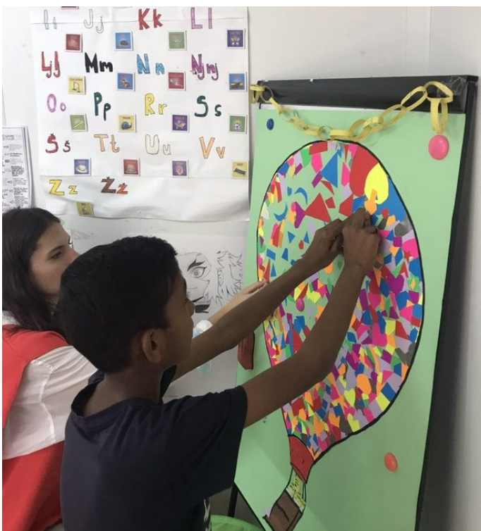
Activities in Child Friendly Spaces

51 workshops for 20 parents were organized by UNICEF/SCI in TRC Borići.