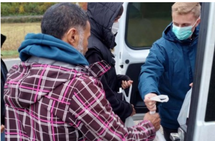
Outreach team distributes food in Una-Sana Canton