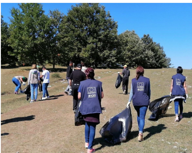
Collective cleaning action

IOM continues to support all TRCs in BiH with vector and pest control activities. Disinfection, disinfestation and derating (DDD) measures are conducted on a weekly basis.