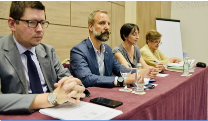
A roundtable on the draft amendments to the Bylaw on asylum

On 20 September, UNHCR organized a roundtable related to the draft amendments to the Bylaw on asylum. The focus of this roundtable was to address the main gaps in existing asylum legislation. The round table was organized within the Instrument for Pre-Accession (IPA) II project “Regional Support to Migration Management in the Western Balkans and Turkey, Phase II” in the context of UNHCR’s effort to support the BiH asylum authorities to fulfil BiH’s pledge to improve asylum legislation.