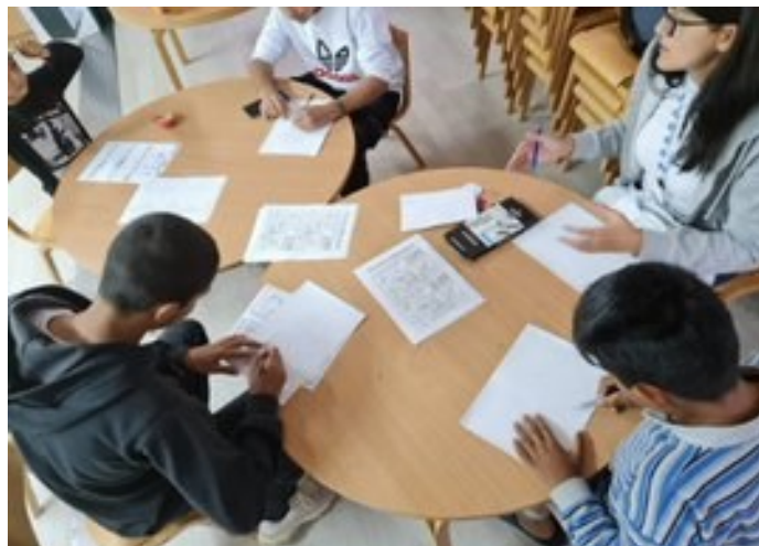
Workshop with children in TRC Ušivak

Furthermore UNFPA BYMC in TRC Ušivak observed a higher reporting rate of violence experienced in the country of origin by Afghan adolescents. Out of a total of eleven newly identified protection cases, nine fall into this category, of which four stated reasons for leaving their homeland as having experienced violence perpetrated by the regime due to different political or religious beliefs. The Boys' Voice representatives presented ideas and key concerns of their peers through five regular meetings, thus developing and advancing their advocacy and leadership skills.