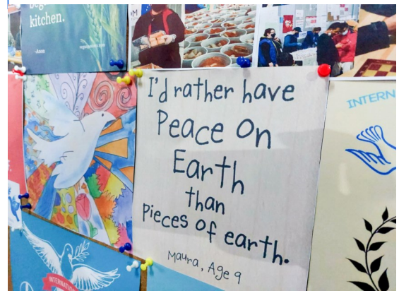
International Day of Peace marked all TRCs in Bosnia and Herzegovina