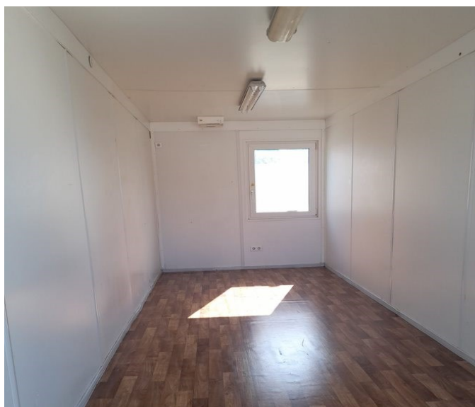
Accommodation unit in TRC Lipa