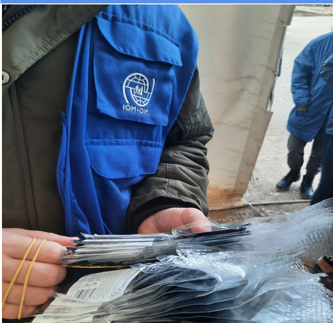
Outreach team distributes NFI to migrants

IOM provides NFIs for newly arriving migrants, refugees and asylum-seekers in all TRCs. An NFI distribution system is in place and operational with set schedules displaying distribution times. IOM provides NFI welcome kits, after which individual NFIs refills are provided. NFIs include items such as clothing, footwear, hygiene products, clean bed sheets and linen, or other medical cases as per need.