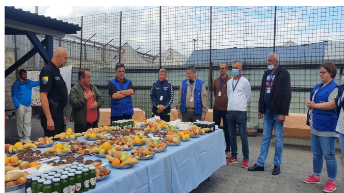
IOM staff and migrants celebrate International Peace Day in TRC Miral

TRC Miral, a ten-day menu started to be displayed in the dining room, with both text and photographs of all meals being prepared by the RC, to better inform migrants of the meals.