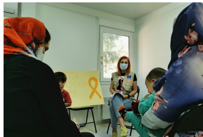
SRH peer support session with residents in TRC Ušivak