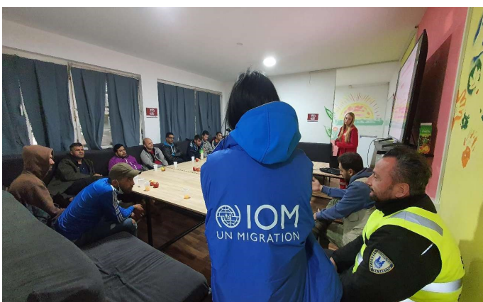
First aid awareness raising sessions in all TRCs

No major incident was recorded in TRCs during the month of September.