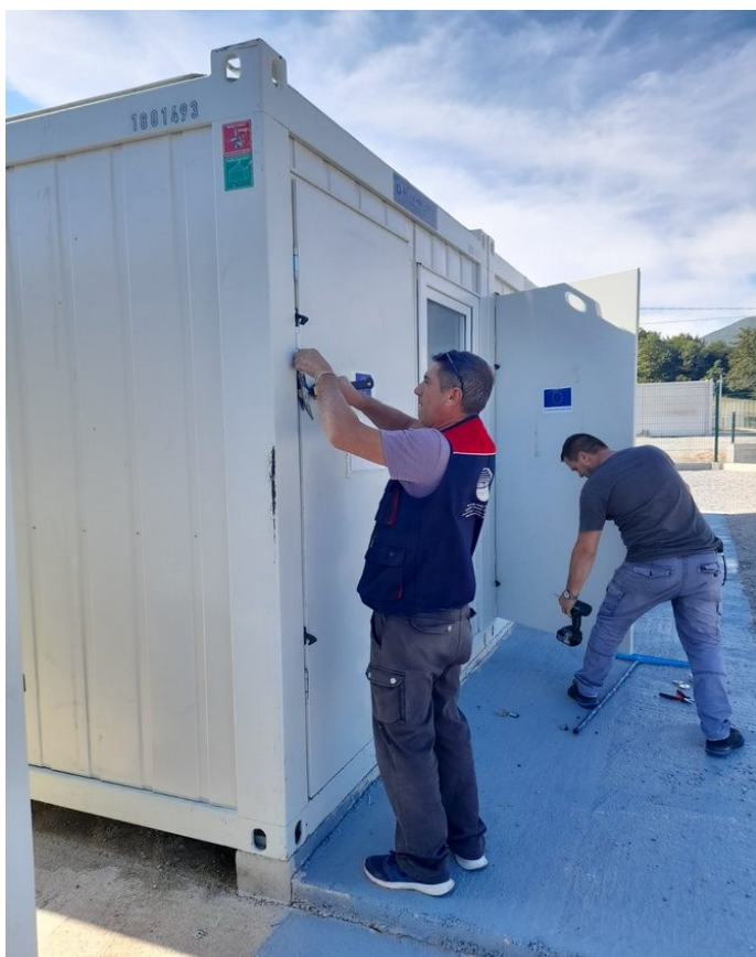
Finalization of construction work in TRC Lipa

SCI continued to support the SFA in ensuring additional shelter for UASC identified out of reception centres across BiH. In September, CCY hosted 47 children, of which there were 40 new arrivals (27 from USC, 10 from Tuzla and 3 from Sarajevo).