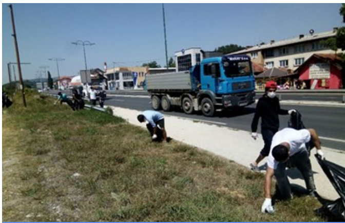
Collective cleaning action in TRC Blažuj

of the field, widening them. Wastewater repair was carried out by digging canals and installing manholes near the BHWI container. In addition, two other sanitary containers were opened in the UASC area, with two water heaters installed. Finally, in front of the family housing units, a wooden platform was built for people with disabilities. Lastly, in August, IPSIA opened the laundry in PC Lipa, in collaboration with the Bihac Red Cross. The laundry offers beneficiaries the opportunity to wash their clothes regularly.