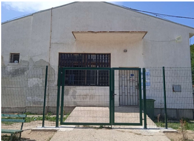
Set-up of a fence around the COVID-19 and preventive isolation areas in TRC Blažuj

TRC Blažuj (opened in December 2019) In August, a company performed air conditioning installation work for on the kitchen, the IOM office and the conference room. In addition, IOM maintenance staff poured concrete into all the larger holes