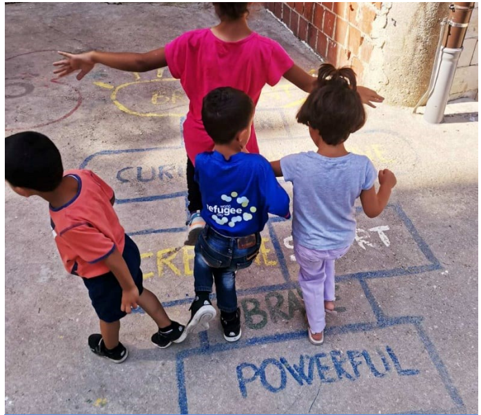
Activities with children in TRC Borići

assistance of other organizations working in the centre. The