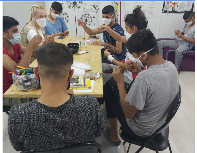
Creative workshop with UASC

Due to the high turnover of the migrant population, the residence time of families and unaccompanied minors is relatively shorter than usual, which increases learning disruptions. Low levels of literacy, especially among unaccompanied minors, also cause disruptions in the learning process. Therefore, among the most recurrent challenges in education is the lack