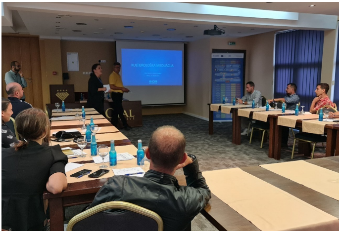
Workshop on the functioning of the new TRC Lipa