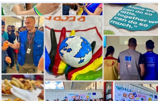
World Humanitarian Day celebrations in all TRCs in Bosnia and Herzegovina