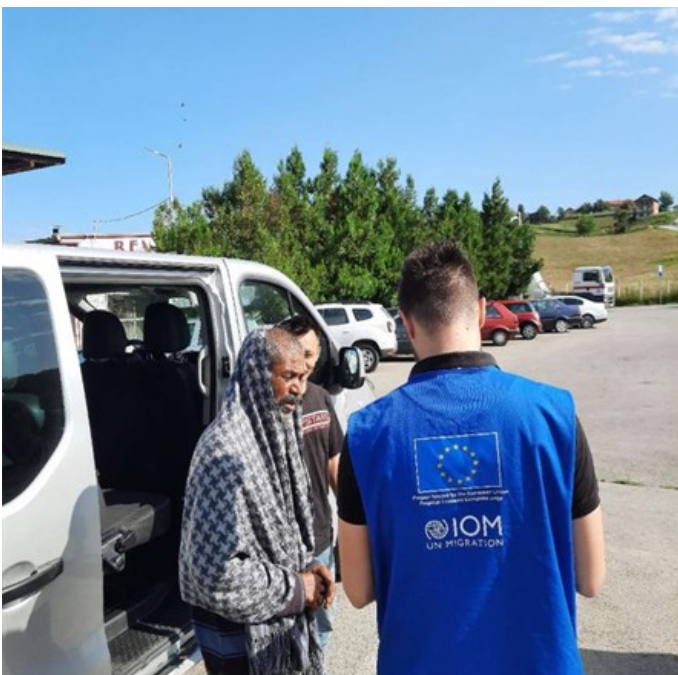
Transportation service provide to migrants and asylum-seekers in need

IOM has on-call mobile teams available 24/7 for assistance and transportation of migrants, refugees and asylum-seekers. These include transportation for medical cases to hospitals, for children going to school, for vulnerable and injured persons heading to centres identified by outreach teams, for asylum-seekers going to asylum interviews, and for transfers at the request of the SFA.