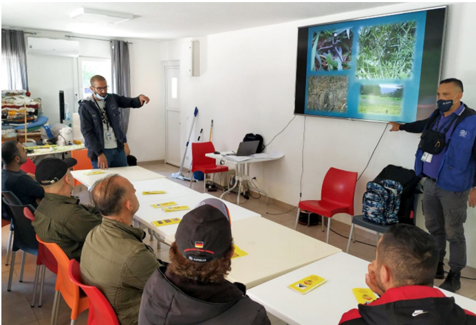
Mine awareness raising sessions in all TRCs

IOM continuously works on improving the security and safety measures in all TRCs by filling the gaps and proactively addressing recommendations.