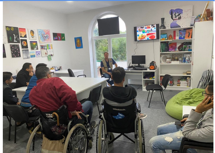
SRH session with residents of TRC Borici

Considering recent developments in Afghanistan and consequent visible distress within the Afghan community in the TRCs, UNFPA in the SC, in partnership with the International Red Cross, helped those affected to establish contacts with their relatives through "Restoring Family Ties". The same practice was agreed for the USC in the following months. In August, UNICEF/MdM teams provided 26 individual psychological counselling sessions and 18 group sessions. A total of 37 children were supported through MHPSS service. Symptoms of anxiety, depression and feelings of hopelessness remain the most common mental health issues reported by them. DRC implementing partner MdM continued implementing MHPSS activities for the adult male population. MdM assisted 261 new direct beneficiaries. A total of 294 mental health consultations and 87 group empowerment sessions were conducted in four TRCs for 660