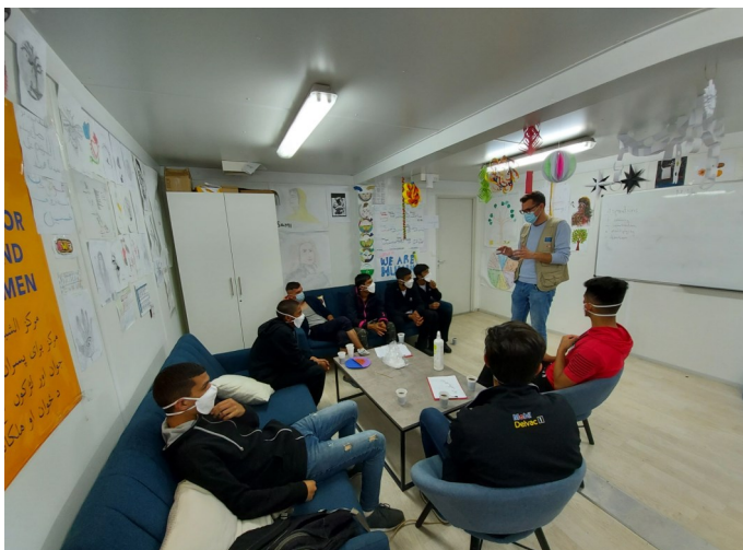
Math class with adolescents boys in TRC Usivak

In TRC Borići, the World Humanitarian Day was celebrated by Red Cross volunteers by planting flowers and playing games. IOM has also provided transportation for migrant children to allow them to participate in sporting activities outside the TRC.