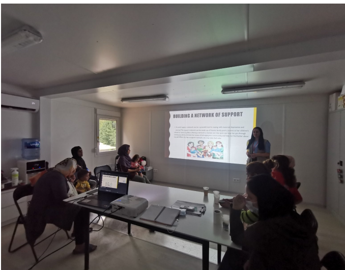
Young Mothers club in TRC Ušivak

For instance, the beginning of August (3 August) was marked by the Council's elections in TRC Borići of new Community Representatives that was organized by the DRC with the