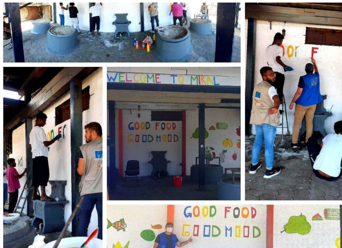
Reorganization of the outdoor kitchen in TRC Miral

In August, the electric cooking booth was transferred from TRC Sedra to be used in the TRC Miral kitchen for the use of Red Cross staff. Moreover, given the closure of TRC Sedra the remaining food was delivered to the IOM/Red Cross outreach team to be distributed to migrants residing in outside location.