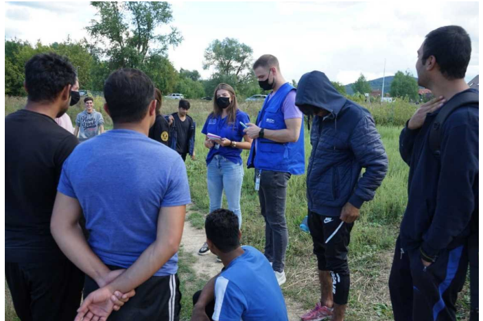
5th DTM exercise conducted in BiH to estimate the number of migrants and asylum-seekers out of reception