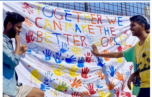
International Youth Day celebrations in all TRCs in Bosnia and Herzegovina © all partners 2021