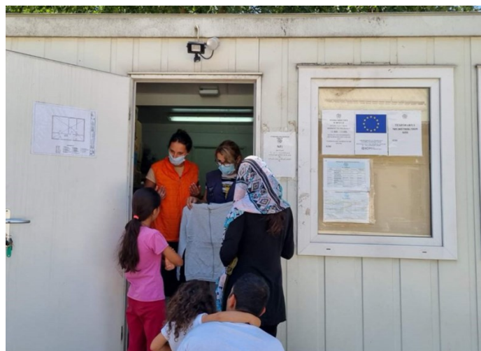
Non-food distribution in TRC Borici

In TRC Borići: 20 boxes of clothes for women and children by