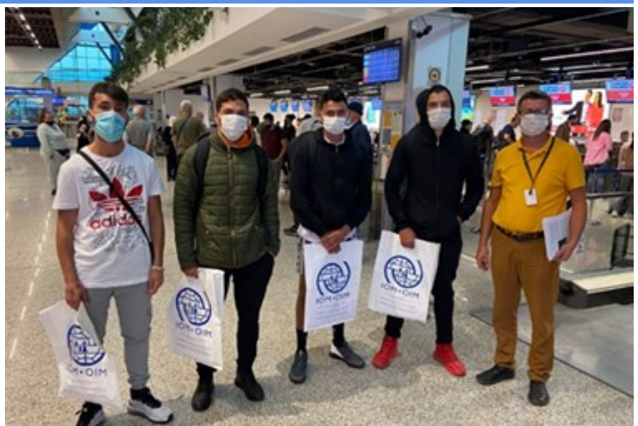
Migrants returning to their Country of Origin through AVRR from Sarajevo International airport

In August, IOM facilitated the return of 18 migrants (7 to Morocco, 6 to Pakistan, 3 to Tunisia, 1 to India and 1 to Iraq). Furthermore, 2,204 migrants were reached by IOM AVRR outreach staff in BiH (392 in centres and 2,012 outside centres). The Outreach Team was present in TRCs/PC, promoting migrants' rights and informed decision on voluntary return and reintegration options and counselling relevant to their decision. Information also include data on mobility restrictions and can be accessed on web page developed for AVRR information campaign as well as Facebook page Support for Migrants .