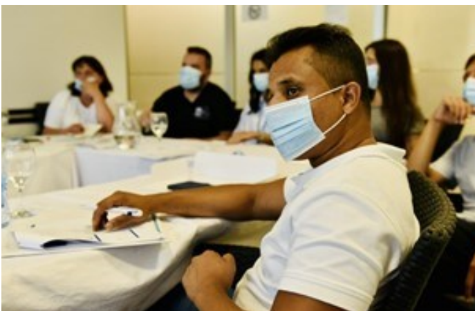
Training session for cultural mediators working for Vasa Prava, BHWI, Save the Children in Tuzla

UNICEF held Child Safeguarding and Child Protection