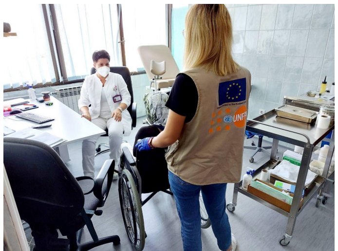
Gynecological examination at Bihać hospital

DRC Medical Assistant in Tuzla regularly visited key spots and shelters where migrants are sleeping in the rough and