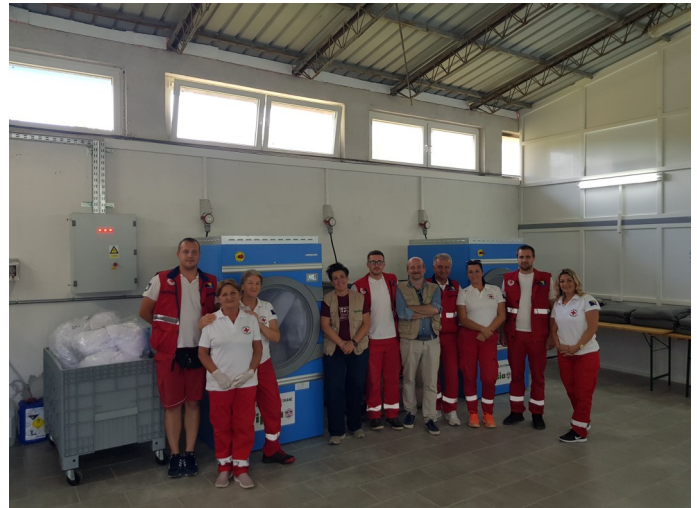
New laundry service by IPSIA and Red Cross in PC Lipa

To set up WASH services at par with the minimum SPHERE standards, IOM dedicates significant efforts to maintenance and repair, particularly of WASH containers and infrastructure, as damages frequently occur in the TRCs. Regular repairs and replacements include sink faucets, toilet tanks and pipes, shower faucets, flushers and water taps. The five TRCs have functional laundry systems for the washing of bedding/sheets and beneficiaries' clothes. In TRC Blažuj, several partners worked together to organize the disinfection of an area prone to bedbugs. The residents of Hangar 11 (240 migrants) were all given new clothes and the hangar area was thoroughly disinfected and blankets and clothes burned. Three new sanitary were connected to the electrical and water systems and new valves and nickel-plated caps were installed in the sanitary containers. The connection to the sewerage system of the sanitary containers donated by Caritas is completed. In TRC Ušivak, the sewage channels were dug in the lower part