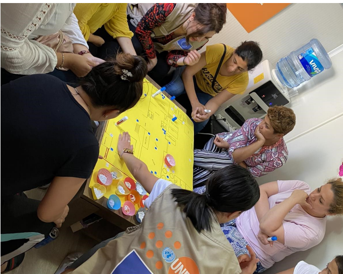
GBV Risk and safety assessment for women in TRC Borici

In August, 56 UASC were identified in front of TRCs Miral and Borici by UNICEF/SCI Child Protection team, out of which 34 UASC agreed to accommodation in the CCY Duje. Another 14 UASC were identified at checkpoint Velecevo by UNICEF/CSW.