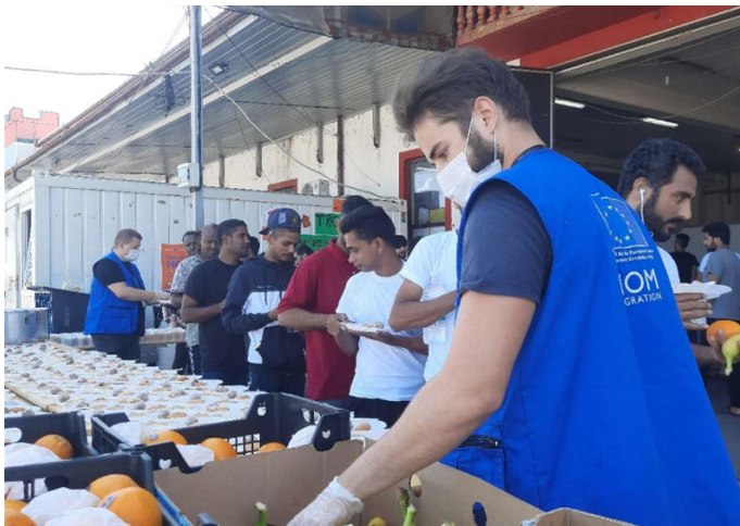
Eid-al-Adha refreshment for migrants and asylum-seekers in TRC Miral

Furthermore, in July, UNFPA BYMCs distributed over 1770 drinks and numerous boxes of dates and biscuits to