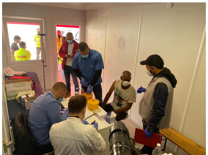
Medical consultation to migrants and asylum-seekers in TRCs

DRC Medical Assistant in Tuzla regularly visited key spots and shelters where migrants are sleeping in the rough and completed 55 direct medical interventions. In addition, six individuals were referred to secondary healthcare. In USC, 167 interventions were performed. A total of 15 referrals were