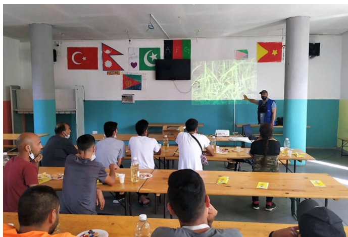
Awareness raising session on dangers of landmines in TRC Borići