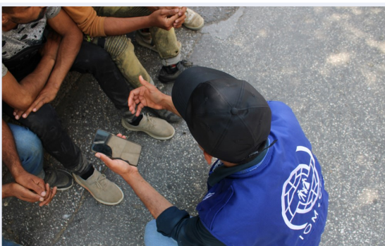
Displacement Tracking Matrix (DTM) exercise conducted on 15 July by IOM together with SFA and SCI legal guardians

The reporting period featured several high-level visits. On 8 July, the Principal Situation Coordinator (PSC) for the Western Balkans at the UNHCR Regional Bureau for Europe visited BiH and together with UNHCR Representative in BiH met with the Mayor of Tuzla to discuss the importance of early identification and