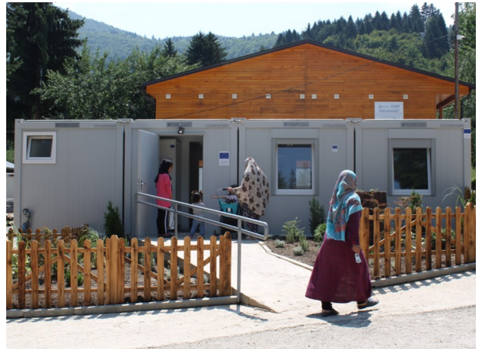
Newly established Mother and Baby WASH unit in TRC Ušivak

To set up WASH services at par with the minimum SPHERE standards, IOM dedicates significant efforts to maintenance and repair, particularly of WASH containers and infrastructure, as damages frequently occur in the TRCs. Regular repairs and replacements include sink faucets, toilet tanks and pipes, shower faucets, flushers and water taps. The five TRCs have functional laundry systems for the washing of bedding/sheets and beneficiaries' clothes. In TRC Borići, due to the heavy water leakage that occurred in the 2nd floor showers through the grouting of the floor up to the 1st floor toilet used by the partner organizations, the IOM carried out repair work: a new coat of grout was applied to stop leaks, while the plasterboard ceiling was replaced in the first-floor toilet. Other work included the repair the boiler in the COVID-19 isolation area and on the mezzanine, as well as the repair the 1st floor fuse box doors, which were found damaged. In TRC Ušivak, on 22 July, the official launch of the new Mother