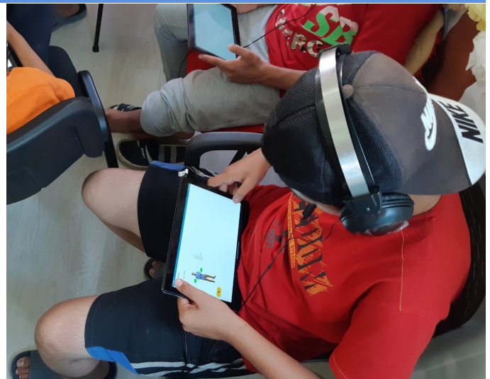
Akelius Digital Language course

A major challenge pertains to the lack of access to secondary education for children over the age of 15. In July, UNICEF met with government counterparts in SC, including the Commissionaire for Migration of SC and the Ministry of Education of SC to discuss next steps to ensure access to education and vocational training for migrant and asylum-seekers' children. The Ministry shared an action plan with the next steps to be taken for the inclusion of refugee and migrant children in formal education in SC. Soon, the Ministry will also share the administrative framework necessary for school enrollment. A MoU will also be prepared and signed soon. In July, UNICEF / SCI organized 15 workshops for 40 parents in TRC Borići. In this regard, special sessions have been launched where parents and children can come and learn the English language together. Moreover, as an additional part of the support for girls, seminars were conducted with girls and mothers in order to strengthen parental skills and support girls' education. In USC, SCI continued to support the enrollment of children in formal education in five primary schools in the municipalities of Bihać and Cazin. In July 125 children finished the school year. In collaboration with the Ministry of Education, SCI initiated and organized Summer School activities and sports courses in nature, in which 60 children participated every day. In July, the cantonal