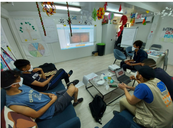
IT session with adolescents in TRC Blažuj

On 21 July, Eid al-Adha was celebrated in all TRCs. IOM, the SFA, partner agencies, and donors organized various events, including the morning prayers, which were guided by the migrant communities of Islamic faith. Refreshments, sweets, traditional cakes, coffee, and tea were prepared in all centres. In TRC Miral, the migrants took the lead in preparing traditional sweets with the support of IOM.