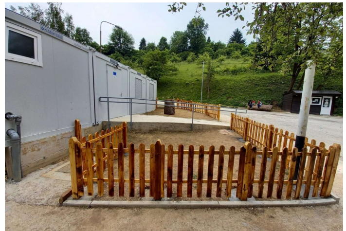
Protection fence set-up around the TRC Blazuj's Medical Unit

A small incident occurred in TRC Borići, where a husband and wife who inquired about their personal belongings, which they claimed had been lost on the day of their transfer from TRC Sedra, began yelling and displaying violence against IOM staff. Back in their room, they started threatening to set fire to the centre and lit small fires with the lighter. Security personnel intervened immediately and put out all potential fires. The police were informed accordingly and both migrants were taken to the Psychiatry Department of the USC Cantonal Hospital.