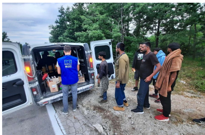
Non-food and Food Items distribution in outreach

IOM provides NFIs for newly arriving migrants, refugees and asylum-seekers in all TRCs. An NFI distribution system is in place and operational with set schedules displaying distribution times. IOM provides NFI welcome kits, after which individual NFIs refills are provided. NFIs include items such as clothing, footwear, hygiene products, clean bed sheets and linen, or other medical cases as per need. NFIs also include packages to hospitalized migrants, refugees and asylum-seekers which contains pyjamas, slippers, a towel and other items necessary for hospital stays. Specially prepared baby packages and other items are available based on needs. All new arrivals in pre-registration or in isolation are provided with hygiene packages (including soap, shampoo, shower gel, toilet paper, tissues) as well as clothes when needed. In July, IOM distributed a total of 46,791 individual items to 3,814 persons. Furthermore, through the Centres for Women and Girls (WGC) and Boys and Young Men Centres (BYMC) , UNFPA continued to distribute modern contraceptives and hygienic products. In July, UNFPA distributed 139 dignity kits and 226 condoms for women. In addition, 5 dignity kits for adolescent boys were distributed, with 144 condoms distributed through Boys and Young Men Centres.