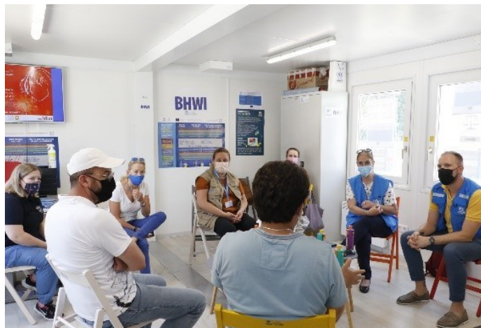
UNHCR Principal Situation Coordinator meeting with migrants and asylum-seekers in TRC Blazuj

registration in the Tuzla area, which borders with Serbia. Meetings were also held with the OSCE Head of Field Office to discuss on the political situation and potential challenges regarding the mixed migration situation. The visit also provided the opportunity for UNHCR to discuss the overall strategy on the Western Balkan region and its cooperation with the European Asylum Support Office (EASO).