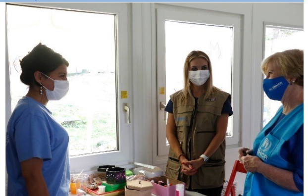
UNHCR Assistant High Commissioner for Protection visiting humanitarian staff and migrants and asylum-seekers in TRC Usivak