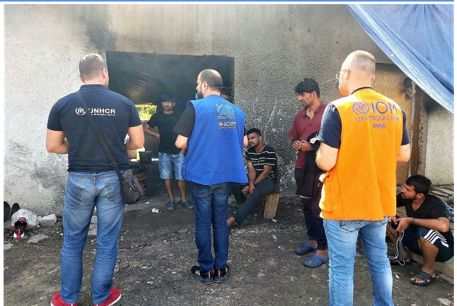
Joint IOM and UNHCR information activity on AVRR, asylum procedure, etc.

In July, IOM facilitated the return of 15 migrants (eight to Pakistan, three to Nepal, two to Afghanistan, one to Egypt and one to Morocco). Furthermore, 4,418 migrants were reached by IOM AVRR outreach staff in BiH (958 in centres and 3,460 outside centres). The Outreach Team was present in TRCs/PC, promoting migrants' rights and informed decision on voluntary return and reintegration options and counselling relevant to their decision. Information also include data on mobility restrictions and can be accessed on web page developed for AVRR information campaign as well as Facebook page Support for Migrants . Starting from mid-July, IOM and UNHCR also started a joint information activity for migrants and asylum-seekers residing in outside location on AVRR, asylum procedures and assistance available in TRCs in BiH.