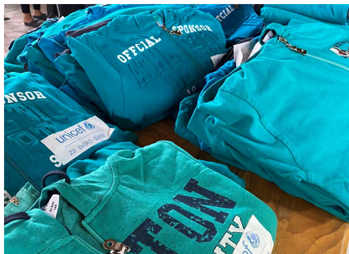
Non-food distribution in TRC Borici

In TRC Borici: a box of new children's clothes by a private citizen; two cots for two newborns by IPSIA.