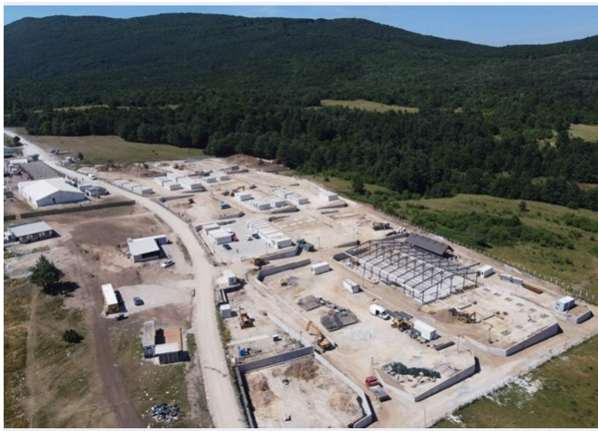
Aerial view of new TRC Lipa after container transfer from Sedra

TRC Blažuj (opened in December 2019) To improve ventilation in the kitchen, the contractor carried out installation work on a new hood. Furthermore, IOM staff built and installed a 16 m 2 long fence around the previously refurbished medical unit building. The fence was painted with the support of DRC staff and the flowers were embedded in the fence. Other work done included painting the walls in the dining room and centre's kitchen; the installation of waterproof lights around