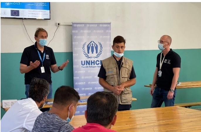
Peer-to-Peer FGD with prospective asylum-seekers in TRC Borici

Between 26 and 30 July, at the meeting of the Working Group to discuss the development of the Strategy and Action Plan on Migration and Asylum for the period 2021-2025, UNHCR presented its comments on the Action Plan and the Strategy at the MoS. The preliminary draft of the Strategy and Action