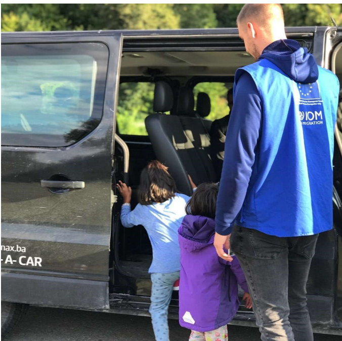
Transportation service provided to migrants and asylum-seekers in need

IOM has on-call mobile teams available 24/7 for assistance and transportation of migrants, refugees and asylum-seekers. These include transportation for medical cases to hospitals, for children going to school, for vulnerable and injured persons heading to centres identified by outreach teams, for asylum-seekers going to asylum interviews, and for transfers at the request of the SFA.