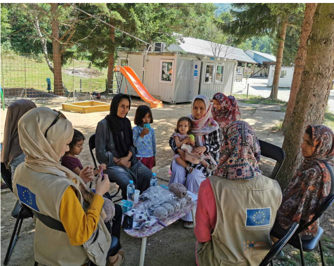
Empowerment sessions for women in TRC Usivak

The Danish Refugee Council (DRC) Protection teams daily compiled protection incident reports, providing inputs on