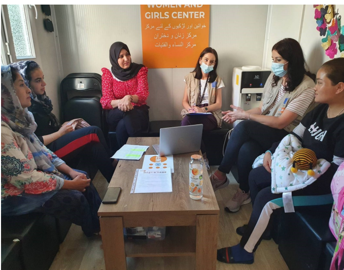
Women and girls committee meeting in TRC Borići

For instance, in July, in TRC Blažuj, Community Representatives were informed about the new IOM sewing corner which opened in July, while they expressed their dissatisfaction with the working hours available for the release of the attestation, which makes it difficult to receive