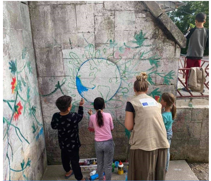
Creative workshop for children in TRC Borići

NFI packages after the registration procedure. Representatives suggested to increase the number of tokens and/or of working hours. In TRC Miral, the IOM Mental Health and Psychosocial Support (MHPSS) staff, with the help of Community Representatives, interviewed migrants and asylum-seekers to find out which specific activities would be of interest to them. Most of the migrants expressed a desire for activities/workshops such as: tailoring, welding, carpentry and painting, especially as some of them had knowledge and experience in the aforementioned occupations. A smaller number of migrants, on the other hand, expressed the desire to conduct more artistic activities, especially painting, and computer activities. In the following period the MHPSS team will discuss possible opportunities to implement these activities with the CCCM.