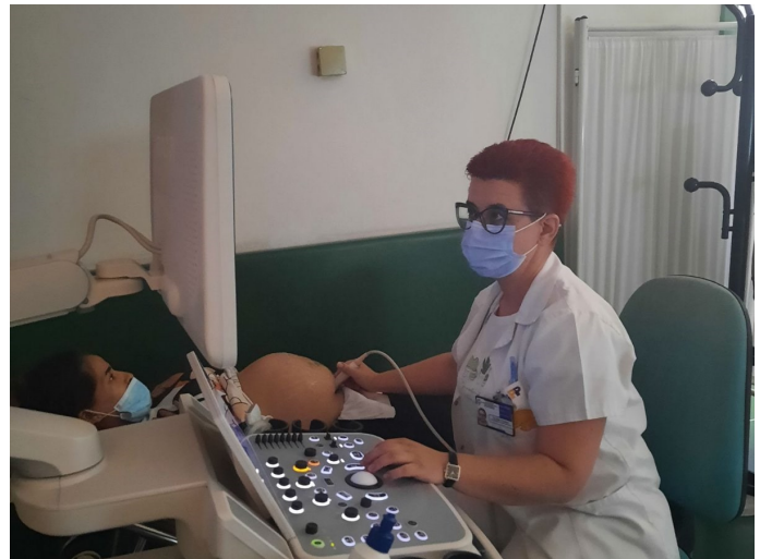
SRH examination for pregnant woman in TRC Usivak

Additionally, UNFPA MHPSS experts provided 22 interventions