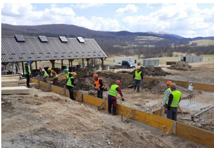
Work on the dining area at the new site TRC Lipa

On 30 April, the second IOM-SFA joint Displacement Tracking Matrix (DTM) exercise aimed to collect information on the number of migrants, asylum-seekers, and refugees present in BiH took place. The exercise was conducted in four Cantons: Una-Sana Canton, Sarajevo Canton, Tuzla Canton, and Herzegovina-Neretva, including 24 municipalities, for a total of 173 locations. Preliminary results showed a total number of 3,314 migrants identified by IOM staff, including 3,221 outside reception facilities.