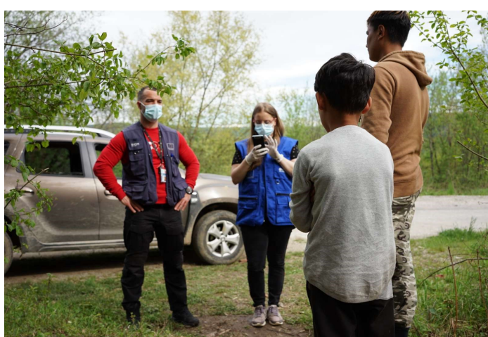
Displacement Tracking Matrix exercise