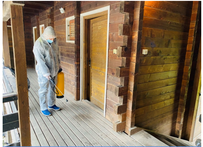
Regular cleaning and disinfection action

To set-up WASH services at par with the minimum SPHERE standards, IOM dedicates significant efforts to maintenance and repair, particularly of WASH containers and infrastructure, as damages occur frequently in the TRCs. Regular repairs and replacements include sink faucets, toilet tanks and pipes, shower faucets, flushers and water taps. The five TRCs have functional laundry systems for the washing of bedding/sheets and beneficiaries' clothes. In TRC Borići, a total of five industrial washing machines and five dryers from the former TRC Bira laundry were transported to the centre, bringing the total number of available washing machine to 15. Caritas will also provide an additional laundry premise which will be working every day except on Sunday. Similarly, to increase the WASH capacity of the centre, one small washing machine was delivered from the central warehouse to TRC Miral. In TRC Blažuj, a major cleaning action was carried out, involving IOM personnel and migrants and asylum-seekers,