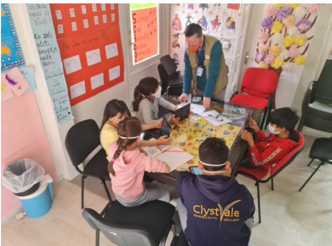
Akelius digital language course in TRC Ušivak

In TRC Miral, IOM organized a special dinner for migrants and asylum-seekers celebrating Easter. In TRC Blažuj, two sewing machines, an ironing board with iron, threads and other supporting tools and materials were delivered to for the purpose of setting up sewing courses in the centre in the