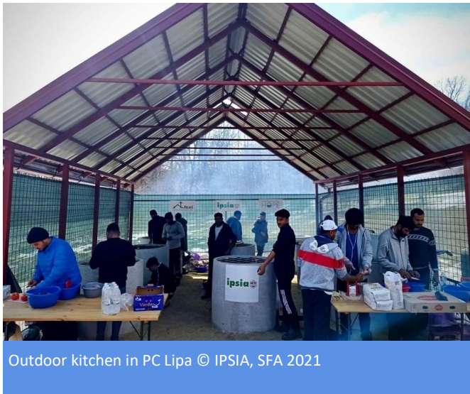
Outdoor kitchen in PC Lipa

TRC Blažuj (opened in December 2019, with current 1700 beds capacity) IOM reorganized the centre, due to the reduced number of migrants and asylum-seekers present, with tent structures and iron poles transported to the IOM warehouse. Moreover, the contractors continued work on the concrete surface for the setup of the new Centre's isolation area, where all 20 containers were delivered during the reporting period. 150 bunk beds, 40 tables, 80 chairs and 300 mattresses were also delivered for use in the isolation area. The Medicine du Monde (MdM) container was delivered and placed next to the Bosnia and Herzegovina Women Initiative (BHWI) organization