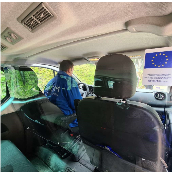
Plexiglass installation on vehicles used to transport migrants and asylum-seekers

IOM has on-call mobile teams available 24/7 for assistance and transportation of migrants, refugees and asylum-seekers. These include transportation for medical cases to hospitals, for children going to school, for vulnerable and injured persons heading to centres identified by outreach teams, for asylum-seekers going to asylum interviews, and for transfers at the request of the SFA.