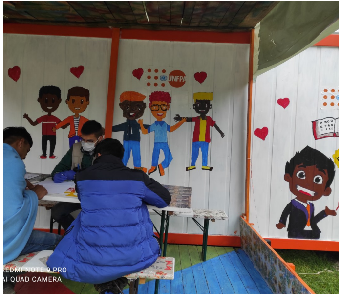
The Boys on the Move session with adolescent boys in the open air

milk/juice during meal distribution, and the possibility to extend DRC’s working hours for medical service (currently from 08:00 AM to 03:00 PM).