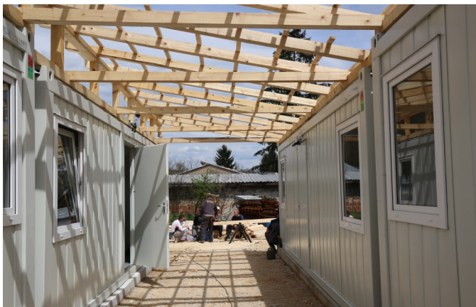
New isolation area in TRC Blažuj

which included cutting down large mounds of bushes around the outdoor kitchen and in the back of the centre. Lastly, in TRC Sedra, works conducted by IOM included the installation of a new water dispenser in the Centre's isolation area, and the replacement of malfunctioning appliances with a new washing machine and dryer.