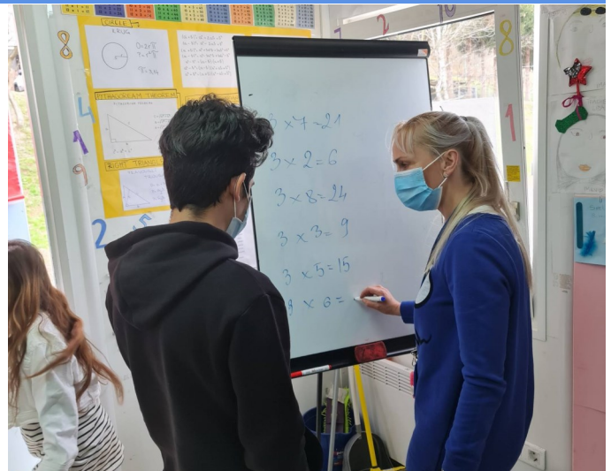
Non-formal education math class in TRC Ušivak

In April, at the Mother and Baby Corner (MBC) in TRC Ušivak education activities for mothers by UNICEF focused on empowering them in different topics concerning the relationship between mother and child, such as good behavior of the child, the importance of cleaning their toys, the