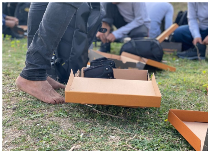
Non-Food Items distribution in outreach

Several donations of non-food items were recorded by various