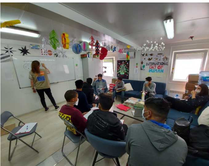
GBV and gender roles with adolescents

In TRC Blažuj, UNFPA reached an agreement with IOM and the SFA on future accommodation mechanisms for vulnerable categories. UNFPA assisted five vulnerable persons arriving