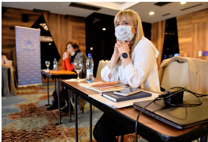
Roundtable on the integration of refugees with the BiH Ministry of Human Rights and Refugees

In TRC Miral, the Memorandum of Understanding (MoU), which was signed between the SFA and IOM on joint Camp Management at the end of 2020, started to be implemented. Starting in April, the SFA will be present inside TRC Miral daily.