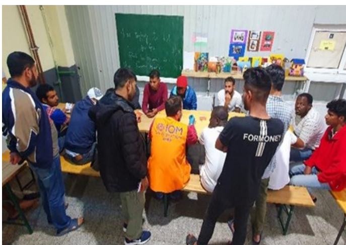
AVRR information sessions in TRC Miral

In April, IOM facilitated the return of 13 migrants (ten to Pakistan, one to Afghanistan, one to Iraq, one to Sri Lanka). Furthermore, 2,430 migrants were reached by IOM AVRR staff