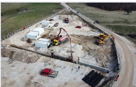
Works on plateaus of TRC Lipa

On April 5, the United Nations (UN) in BiH issued a press release calling for urgent action to end violent pushbacks and collective expulsions of migrants, asylum-seekers, and refugees, including children. The press release was issued in response to an incident that occurred on April 2, during which outreach teams encountered a group of 50 men walking close to the official border crossing with Croatia in the direction of Bihać, visibly exhausted, in need of clothes and shoes, and with wounds on their bodies.