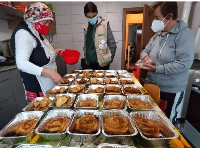
“Burek” pie preparation and distribution for Ramadan

Furthermore, in April, the UNFPA BYMC distributed over 1000 drinks and dozens of boxes of dates and biscuits to adolescents and young men participating in regular BYMC activities.