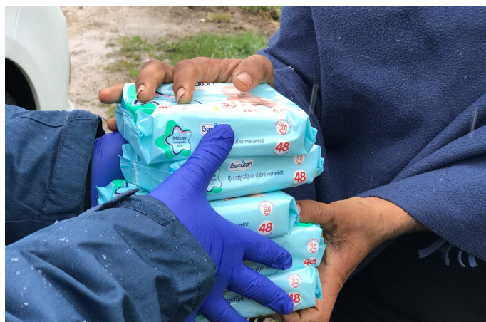
Non-Food Items distribution in outreach

IOM provides NFIs for newly arriving migrants, refugees and asylum-seekers in all TRCs. An NFI distribution system is in place and operational with set schedules displaying distribution times. IOM provides NFI welcome kits, after which individual NFIs refills are provided. NFIs include items such as clothing, footwear, hygiene products, clean bed sheets and linen, or other medical cases as per need. NFIs also include packages to hospitalized migrants, refugees and asylum-seekers which contains pyjamas, slippers, a towel and other items necessary for hospital stays. Specially prepared baby packages and other items are available based on needs. All new arrivals in pre-registration or in isolation are provided with hygiene packages (including soap, shampoo, shower gel, toilet paper, tissues) as well as clothes when needed. In April, IOM distributed a total of 53,242 individual items to 4,300 persons in centres. Furthermore, through the Centres for Women and Girls (WGC) and Boys and Young Men Centres (BYMC) , UNFPA continued to distribute modern contraceptives and hygienic products. In April, UNFPA distributed 470 dignity kits and around 520 contraceptives for women. In addition, 10 dignity kits for adolescent boys and 10 for young men, and around 200 condoms were distributed through Centres for Boys and Young men.