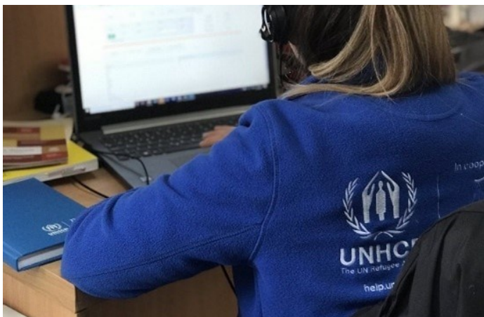
New call center to increase reach to potential asylum-seekers

Lastly, separation of families remains a challenge as parents continue to leave children behind, while they pursue onward movement. Although concrete steps have been agreed with the competent CSWs, it is often very challenging to find an adequate solution that provides optimal protection, especially for unaccompanied girls and younger children.