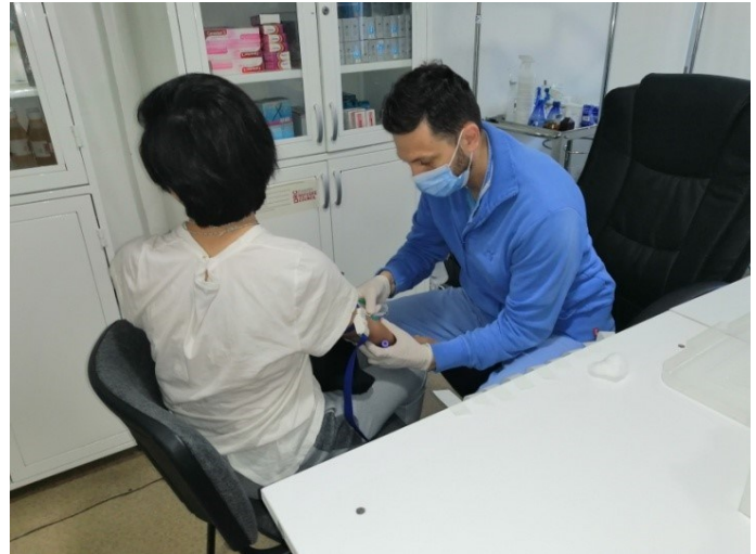
Laboratory check-ups in TRC Borici

Additionally, UNFPA MHPSS experts provided 28 interventions in crisis situations, mostly given by the impact of their attempt to cross the border to the EU. In USC TRCs', UNFPA MHPSS staff identified and referred seven women for essential psychiatric services in the form of examinations and prescription of therapy, after which they continued to be actively monitored.