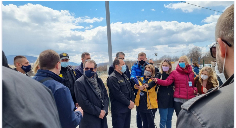
IOM Chief of Mission visit, together with the Bosnia and Herzegovina Ministry of Security in TRC Lipa