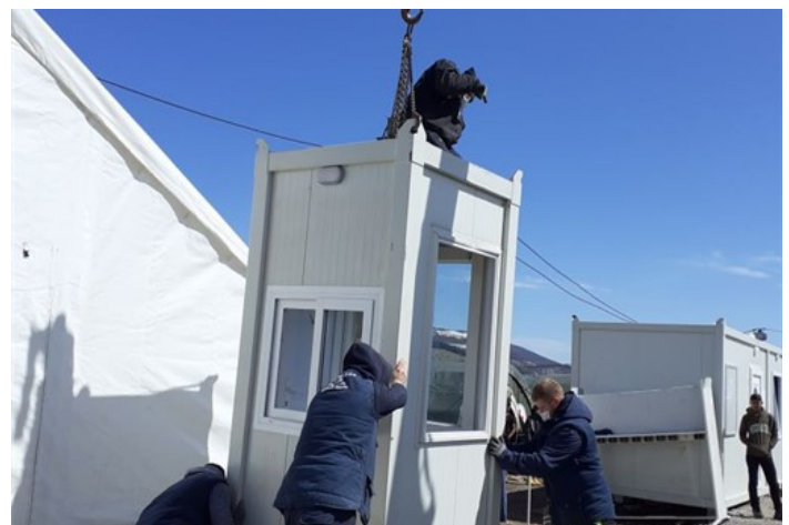
New security containers and booths in PC Lipa

In TRC Sedra, another incident occurred involving migrants and asylum-seekers who started throwing food and overturning tables in the dining hall, while screaming and threatening the Centre's staff. According to other migrants present at the time, the group was dissatisfied with the suhoor meal. IOM and partner organizations' staff were immediately evacuated, and local police were called. During the night, the same group complained again and started yelling that they would destroy the centre. IOM called the police again and on the following day, the SFA relocated five migrants who had instigated these incidents to other centres, due to threats and destruction of property. In response, IOM agreed to open the community kitchen from 12am to 3am so that migrants can prepare their own food. IOM also distributed additional canned food together with the regular suhoor meal.