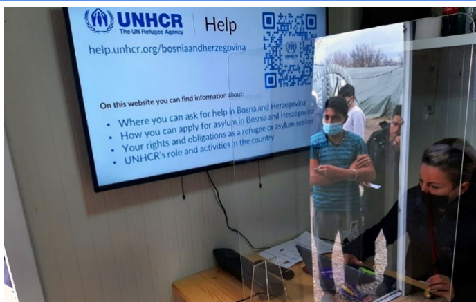
Dividers for SFA registration area and screens with key messages to prospect asylum-seekers in PC Lipa

UNHCR provided dividers in the SFA registration area of PC Lipa and ensured availability of messaging screens with key information for prospect asylum-seekers in several of their languages.