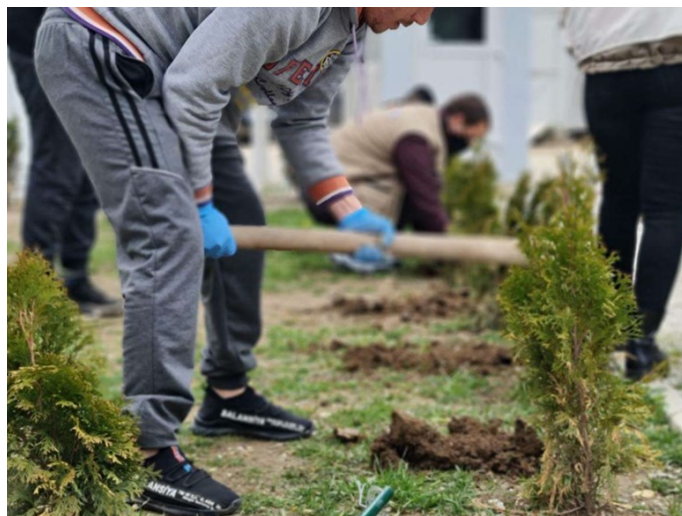
Gardening activities with migrants and asylum-seekers in TRC Blažuj

IOM encourages beneficiaries in the reception centres to play an active role in decision-making processes and activities. TRCs have Community Representative Councils and regular meetings are organized by IOM with partner agencies. These serve as a platform for discussion of TRC issues, conflict prevention and resolution, dialogues between different beneficiary groups, and between the migrants and TRCs’ management teams. For instance, in April, Community representatives from all TRCs were informed of the new Ramadan menu and the prolonged opening hours of the kitchen, so that migrants could prepare their own suhoor if they wish. Furthermore, in TRC Blažuj, Community representatives discussed the decision to provide an additional table in the dining room where migrants and asylum-seekers can get extra doses of