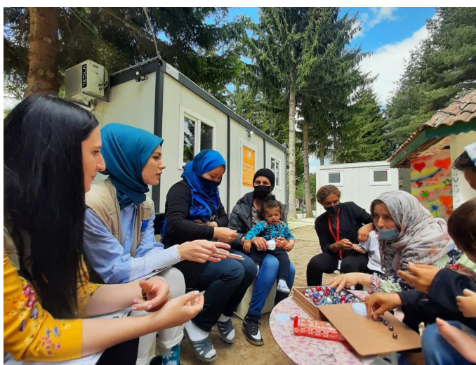
Women and Girls Center meeting

Conditions observed in outreach were symptoms of respiratory system diseases, skin diseases and subcutaneous tissue, diseases of the musculoskeletal system and connective tissue and digestive diseases symptoms and an increase of digestive diseases symptoms, followed by injuries, poisoning and other symptoms caused by external causes. Overall, the incidence of the above-mentioned conditions is similar to the previous reporting month.