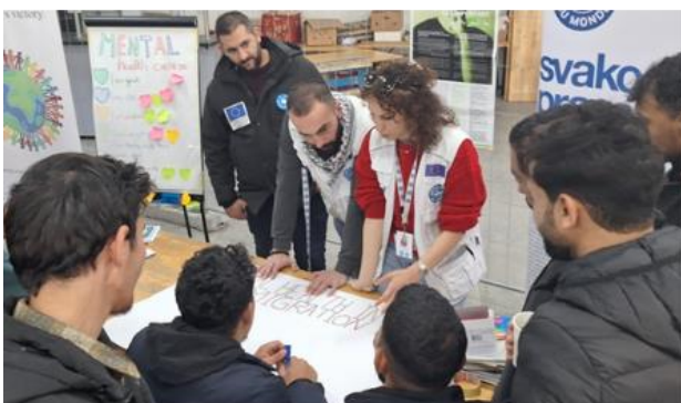
Group psychological and mental health sessions @MdM 2023 (DRC partner)