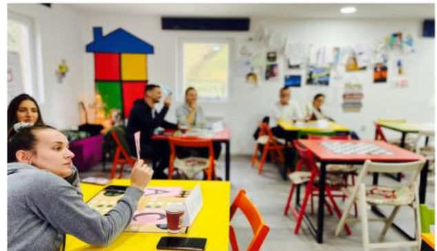
GBV educational Quiz with frontline humanitarian personnel in TRC Blažuj @UNFPA 2023