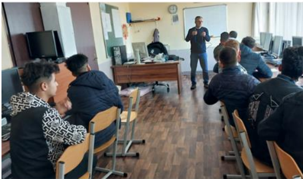
Vocational training in Technical school Bihać.