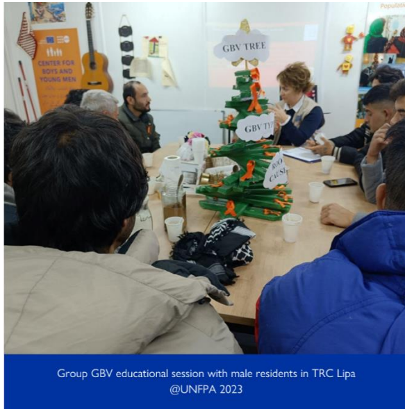
Group GBV educational session with male residents in TRC Lipa

During December, male and female residents of TRCs benefited from the UNFPA GBV educational program that focused on prevention and empowerment in the fight against GBV. Through participation, women and young men were equipped with tools to recognize and combat various forms of abuse, and to foster an environment intolerant to GBV. Within the “16 Days of Activism against GBV” campaign, a competitive quiz on the topic of GBV in emergencies was held with frontline humanitarian personnel, elevating knowledge, promotion of non-violent attitudes, and familiarization with the basic concept of GBV with the aim of prevention and adequate response.