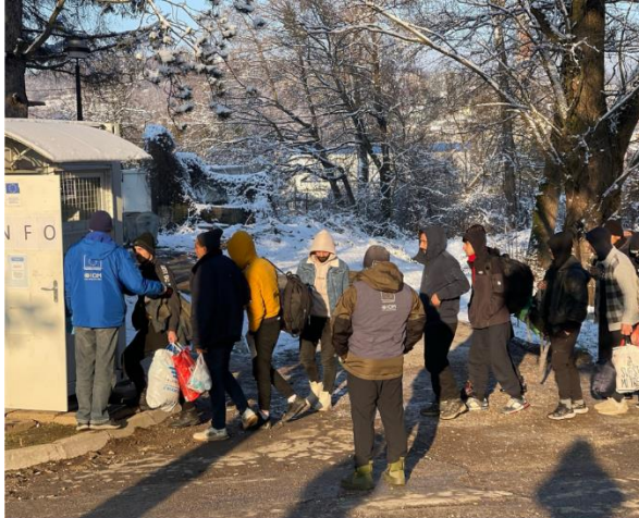
Providing information and accommodation to new beneficiaries in TRC Blažuj @IOM 2023