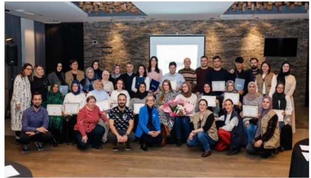
Asylum-seeking and refugee students at their graduation ceremony of B/C/S language