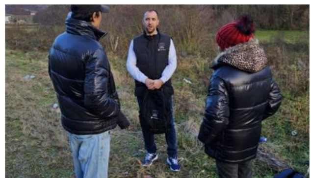
SC legal guardian supporting UASC in Donja Vidovska @SCI 2023