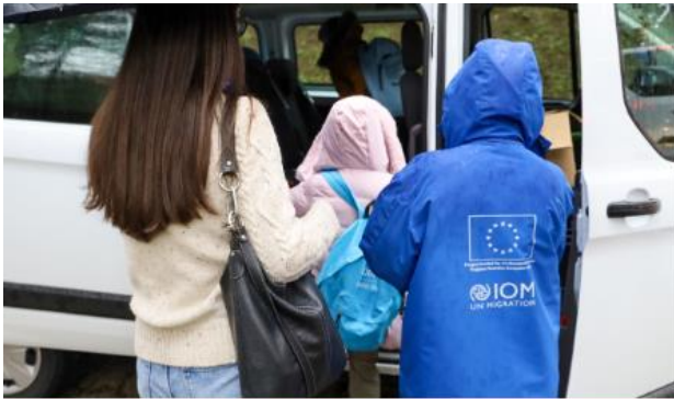
IOM providing school transportation services TRC Ušivak