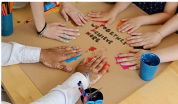
Family zone activity in TRC Borići @UNICEF 2023