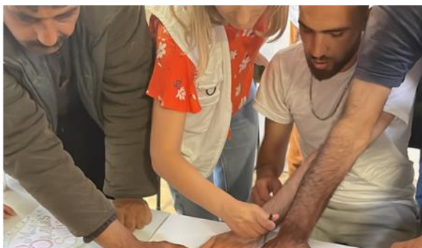
International Day against Drug Abuse and Illegal Trafficking workshop @DRC 2023