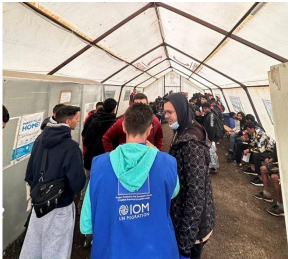
Waiting zone for IOM emergency screening in TRC Blažuj