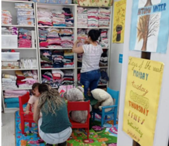
Distribution of NFIs in Mother Baby Corner in TRC Borići