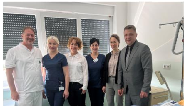
Donation to the Cantonal Hospital Bihac