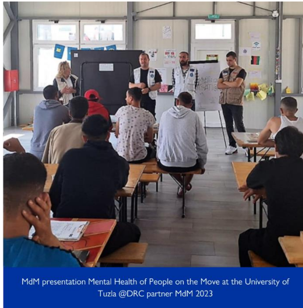
MdM presentation Mental Health of People on the Move at the University of Tuzla

Due to ongoing challenges related to human resources and the vacation season, medical technicians from Primary Health Centers (PHCs) faced difficulties in fulfilling their responsibilities in the TRCs, leading to a decline in medical interventions. To address this situation, the medical staff of the DRC stepped in to provide additional support to the PHC doctors , offering both medical assistance and administrative aid.