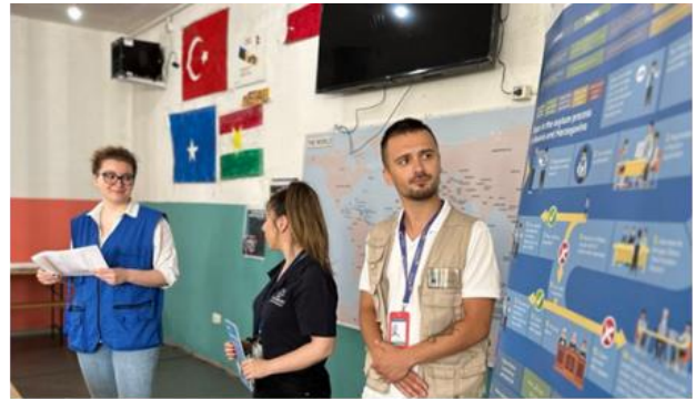
Joint IOM – UNHCR/Vaša prava BiH information session in TRC Borići