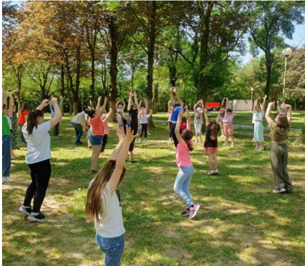
Summer School for Children on the Move and children from four local elementary schools @SCI 2023