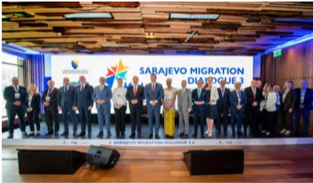
High-level representatives of the Western Balkans during the third Sarajevo Migration Dialogue @IOM 2023