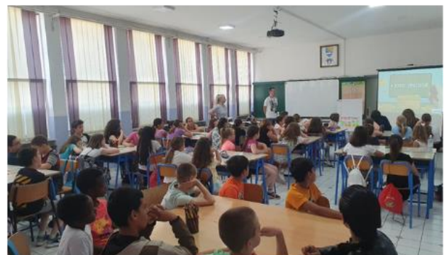
Etiquette class for Children on the Move and children from four local elementary school @SCI 2023