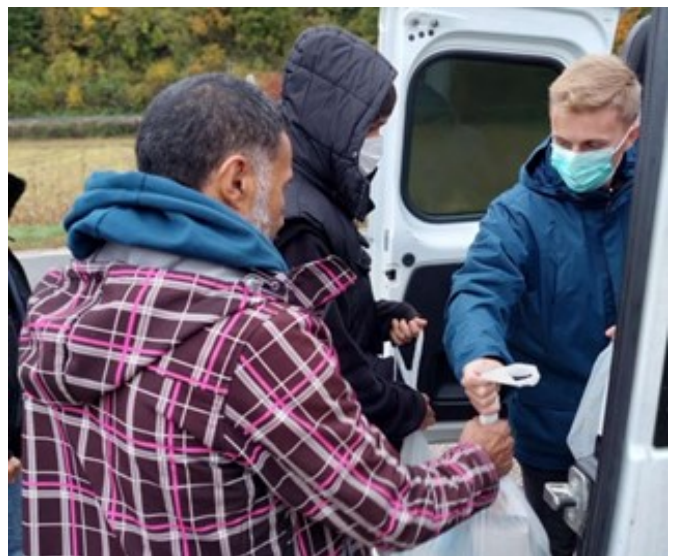
IOM Outreach team shares food and NFI items

IOM/Red Cross outreach teams continued to provide food and NFI packages, PPE, such as facial masks, single use gloves, and disinfection gels. The NFIs included clothes, hygiene items, sleeping bags, backpacks, shoes, jackets and raincoats. The IOM outreach team handed over 350 non-food items (NFIs) for distribution to migrants identified nearby TRC Miral, who stated they had been involved in alleged pushback cases. Consequently, a total of 259 NFIs were distributed to 44 migrants for the mentioned purpose, including 108 hygiene items, 39 pairs of shoes, 34 jackets, and 78 clothing.