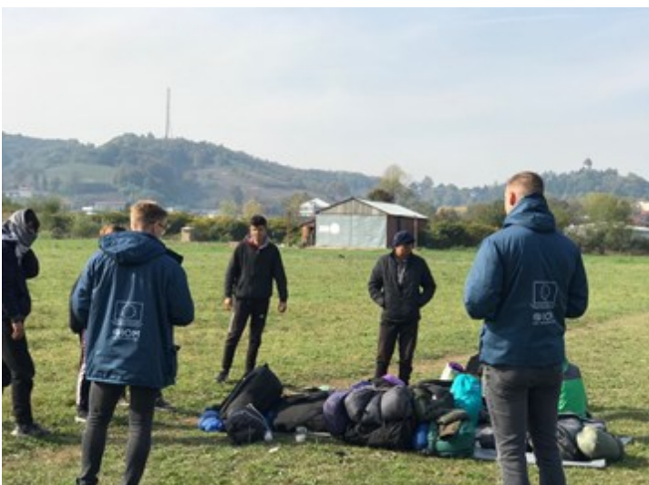
IOM Outreach team orgnaizing transport for migrants and asylum-seekers in USC