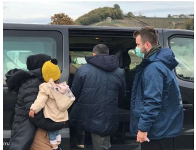
IOM Outreach team organizing transport for families to reception facilities

In October, the organized transports included 291 to medical facilities, 14 to SFA, 105 for education purposes, 33 outreach and 107 others (which also includes transports between TRCs), in both USC and SC. In addition to that, the IOM outreach teams carried out 499 transports for 1860 migrants and asylum seekers.