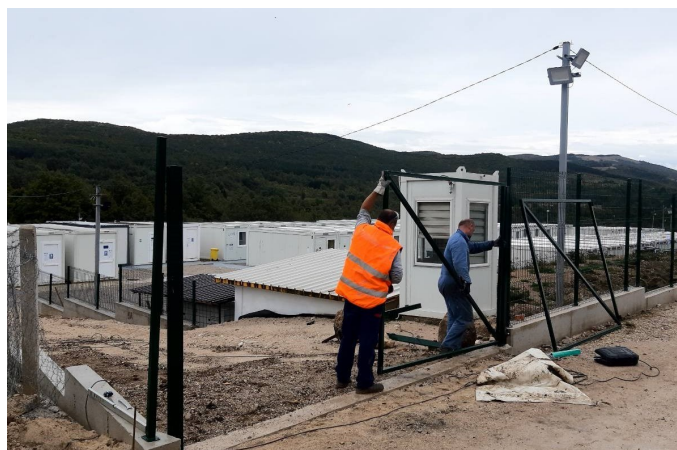
Works on arrangements of fences in TRC Lipa

SCI continued to support the SFA in ensuring additional shelter for UASC identified out of reception centres across BiH. In October, CCY in R Duje (Tuzla Canton) hosted 52 children, representing a 3 per cent increase compared to September.