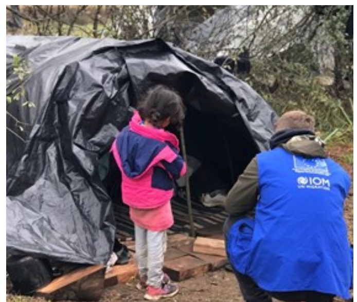
IOM Outreach team screening beneficiaries in USC