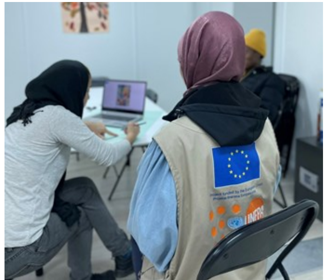
IT session in Women and Girls Centre in TRC Ušivak

On 12 October a concert of migrant musicians from Guinea was held in TRC Miral entitled "Talents of people in movement". The event was organized by IOM in coordination with SFA, UNFPA, the "Žene sa Une" and migrants. A presentation of the traditional dance of migrants from Pakistan was also organized, as well as a joint meeting with autumn sweets and hot drinks.