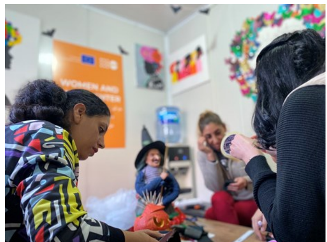
Preparation for Halloween in Women and Girls Centre in TRC Borići