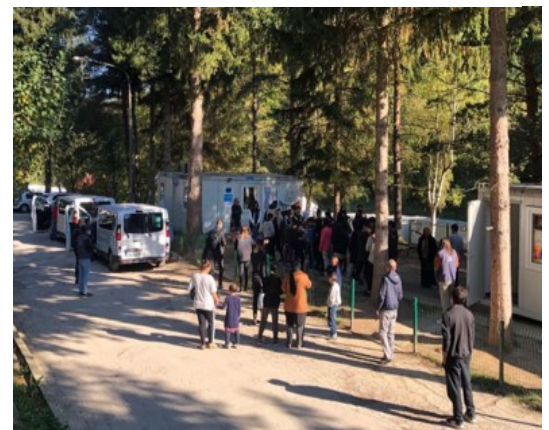
62 children accommodated in TRC Ušivak started school with the support of IOM, UNICEF, © IOM 2021