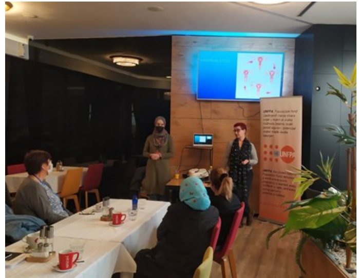
SRH sessions provided to women and girls who reside outside of reception centres

In October, 96 women and adolescent girls participated in eight SRH sessions organized by UNFPA gynaecologists about contraception, sexually transmitted diseases (STDs), menstrual cycle, raising awareness on breast cancer and self-examination. Following individual consultations, 26 women and girls underwent detailed SRH examinations in the local health clinics. According to the identified need, SRH supplements were distributed to 40 women.