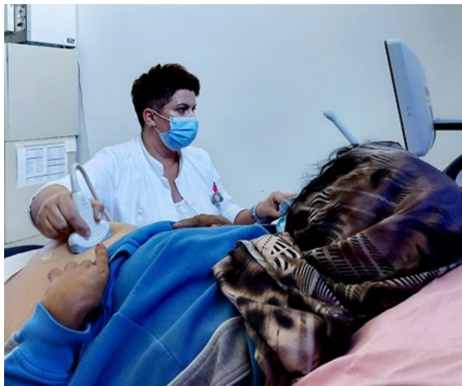
Gyneacologist examination in Bihać Health Care Centre

The UNFPA team provided translation support during the COVID-19 vaccination process in TRC Blazuj. In addition, 17 COVID-19 and health awareness raising sessions in SC for 172 adolescents and young men within the centres were conducted, while 503 counselling sessions were provided by UNFPA team in out of reception sites.