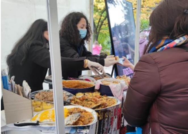
UNHCR partner Bosnia and Herzegovina Women's Initiative together with persons under international protection distributed food on 24 October, the United Nations Day

As part of the visit, meetings were held with the USC Prime Minister, the USC Minister of Education, school principals and other school staff, UNICEF and SCI.