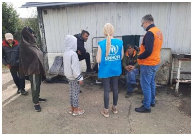
IOM/AVRR and UNHCR teams in joint outreach in USC

In October, IOM facilitated the return of 13 migrants (4 to Morocco, 4 to Pakistan, 2 to Iraq, 1 to Turkey, 1 to Algeria, and 1 to Bangladesh). Furthermore, 1,809 migrants were reached by IOM AVRR outreach staff in BiH (190 in centres and 1,619 outside centres). The Outreach Team was present in TRCs/PC, promoting migrants' rights and informed decision on voluntary return and reintegration options and counselling relevant to their decision. Information also include data on mobility restrictions and can be accessed on web page developed for AVRR information campaign as well as Facebook page Support for Migrants .