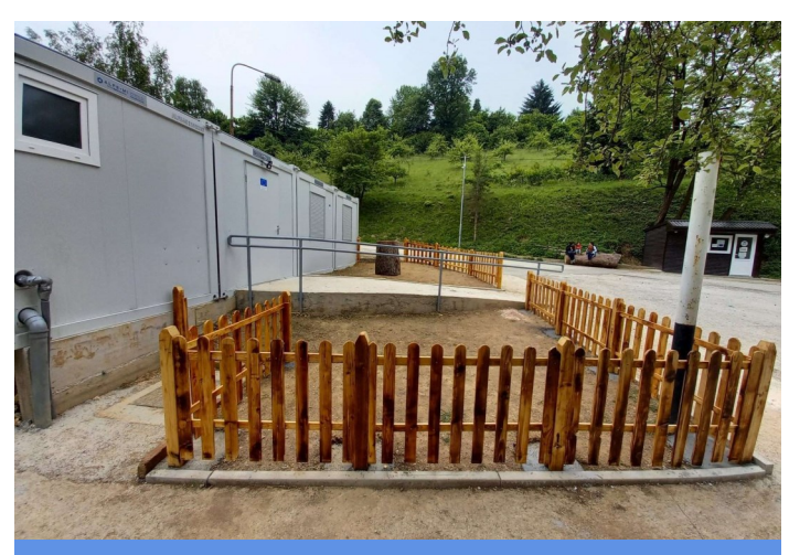
Protection fence set-up aoournd the TRC Blazuj's Medical Unit

A small incident occurred in TRC Borići, where a husband and wife who inquired about their personal belongings, which they claimed had been lost on the day of their transfer from TRC Sedra, began yelling and displaying violence against IOM staff. Back in their room, they started threatening to set fire to the centre and lit small fires with the lighter. Security personnel intervened immediately and put out all potential fires. The police were informed accordingly and both migrants were taken to the Psychiatry Department of the USC Cantonal Hospital.