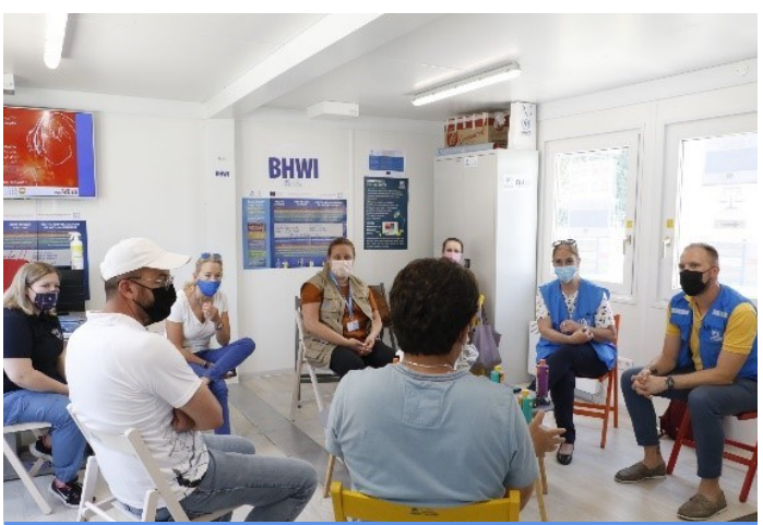
UNHCR Principal Situation Coordinator meeting with migrants and asylum-seekers in TRC Blazuj

profiling activities of the Sudanese and Somali populations present in BiH, as part of a series of profiling exercises conducted for unique populations identified in the country while a large proportion of the population present BiH is likely in need of international protection, they are not interested in pursuing it here and are intent on continuing the movement