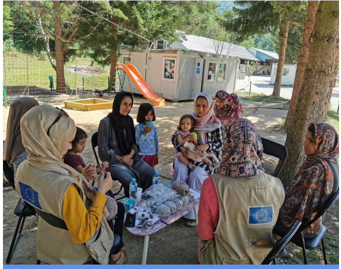
Emprowerment sessions for women in TRC Usivak

The Danish Refugee Council (DRC) Protection teams daily compiled protection incident reports, providing inputs on