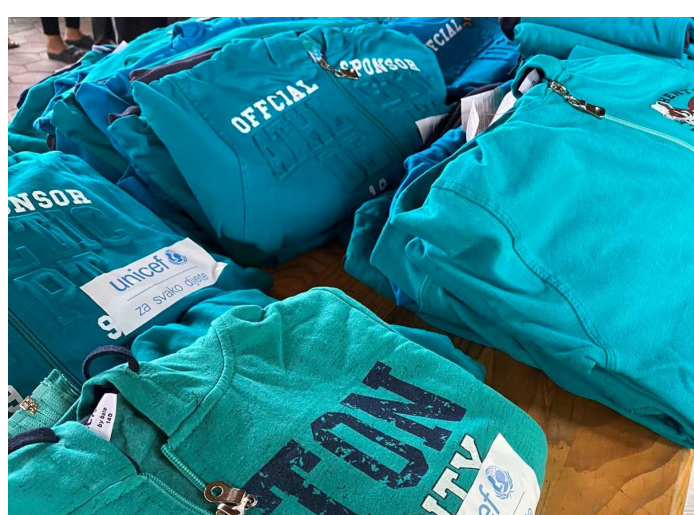
Non-food distribution in TRC Borici

In TRC Borići: a box of new children's clothes by a private citizen; two cots for two newborns by IPSIA.