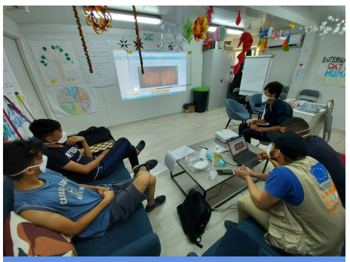
IT session with adolescents in TRC Blazuj

A major challenge pertains to the lack of access to secondary education for children over the age of 15. In July, UNICEF met with government counterparts in SC, including the Commissionaire for Migration of SC and the Ministry of Education of SC to discuss next steps to ensure access to education and vocational training for migrant and asylumseekers' children. The Ministry shared an action plan with the next steps to be taken for the inclusion of refugee and migrant children in formal education in SC. Soon, the Ministry will also share the administrative framework necessary for school enrollment. A MoU will also be prepared and signed soon. In July, UNICEF / SCI organized 15 workshops for 40 parents in TRC Borići. In this regard, special sessions have been launched where parents and children can come and learn the English language together. Moreover, as an additional part of the support for girls, seminars were conducted with girls and mothers in order to strengthen parental skills and support girls' education. In USC, SCI continued to support the enrollment of children in formal education in five primary schools in the municipalities of Bihać and Cazin. In July 125 children finished the school year. In collaboration with the Ministry of Education, SCI initiated and organized Summer School activities and sports courses in nature, in which 60 children participated every day. In July, the cantonal