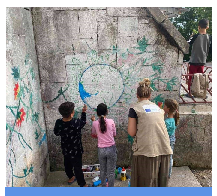
Creative workshop for children in TRC Borici

NFI packages after the registration procedure. Representatives suggested to increase the number of tokens and/or of working hours. In TRC Miral, the IOM Mental Health and Psychosocial Support (MHPSS) staff, with the help of Community Representatives, interviewed migrants and asylum-seekers to find out which specific activities would be of interest to them. Most of the migrants expressed a desire for activities/workshops such as: tailoring, welding, carpentry and painting, especially as some of them had knowledge and experience in the aforementioned occupations. A smaller number of migrants, on the other hand, expressed the desire to conduct more artistic activities, especially painting, and computer activities. In the following period the MHPSS team will discuss possible opportunities to implement these activities with the CCCM.