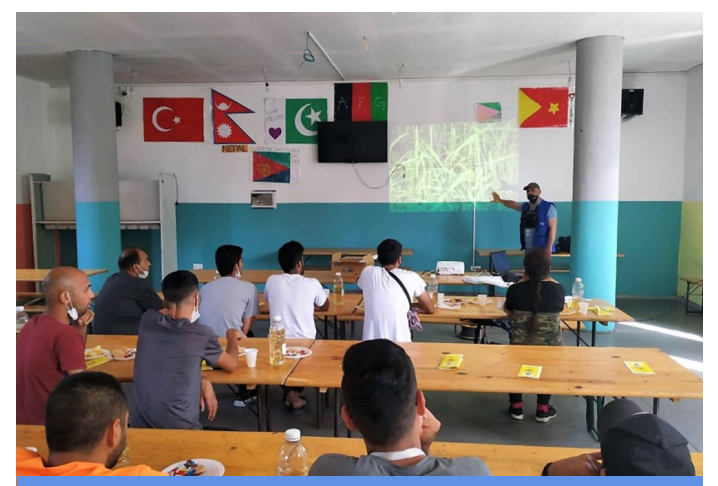
Awareness raising session on dangers of landmines in TRC Borići

registration in the Tuzla area, which borders with Serbia. Meetings were also held with the OSCE Head of Field Office to discuss on the political situation and potential challenges regarding the mixed migration situation. The visit also provided the opportunity for UNHCR to discuss the overall strategy on the Western Balkan region and its cooperation with the European Asylum Support Office (EASO).