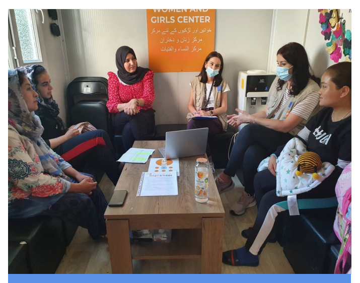
Women and girls committee meeting in TRC Borici

For instance, in July, in TRC Blažuj, Community Representatives were informed about the new IOM sewing corner which opened in July, while they expressed their dissatisfaction with the working hours available for the release of the attestation, which makes it difficult to receive