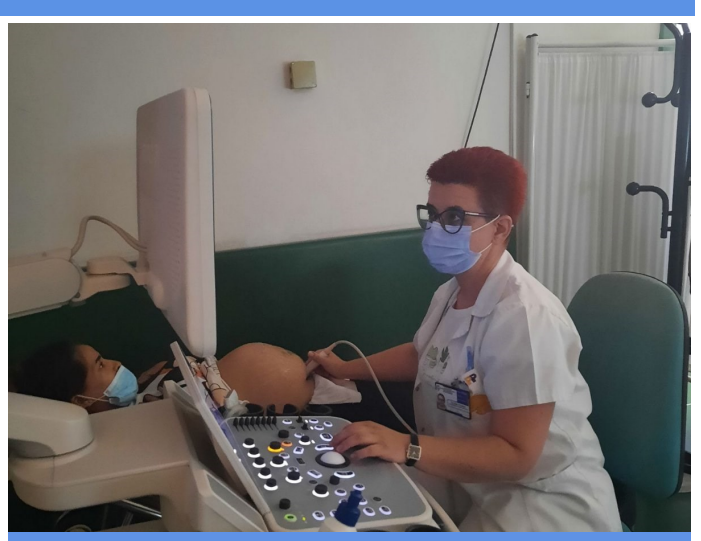
SRH examination for pregnant woman in TRC Usivak

400 individual MHPSS sessions and 107 group MHPSS sessions provided to women, men and children by DRC, MdM, UNFPA and UNICEF