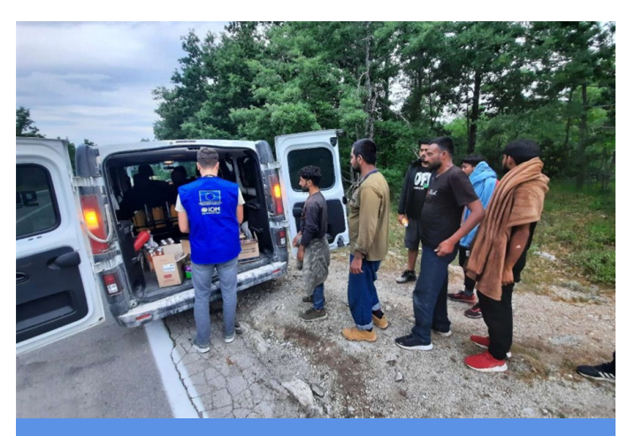
Non-food and Food Items distribution in outreach

IOM provides NFIs for newly arriving migrants, refugees and asylum-seekers in all TRCs. An NFI distribution system is in place and operational with set schedules displaying distribution times. IOM provides NFI welcome kits, after which individual NFIs refills are provided. NFIs include items such as clothing, footwear, hygiene products, clean bed sheets and linen, or other medical cases as per need. NFIs also include packages to hospitalized migrants, refugees and asylumseekers which contains pyjamas, slippers, a towel and other items necessary for hospital stays. Specially prepared baby packages and other items are available based on needs. All new arrivals in pre-registration or in isolation are provided with hygiene packages (including soap, shampoo, shower gel, toilet paper, tissues) as well as clothes when needed. In In July, IOM distributed a total of 46,791 individual items to In TRC Miral: 320 pieces of hard soap by the Red Cross 3,814 persons. Furthermore, through the Centres for Women and Girls (WGC) and Boys and Young Men Centres (BYMC), UNFPA continued to distribute modern contraceptives and hygienic products. In July, UNFPA distributed 139 dignity kits and 226 condoms for women. In addition, 5 dignity kits for adolescent boys were distributed, with 144 condoms distributed through Boys and Young Men Centres.