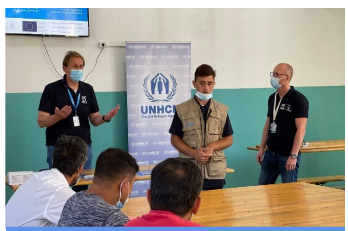
Peer-to-Peer FGD with prospective asylum-seekers in TRC Borici© UNCHR. VP 2021

Between 26 and 30 July, at the meeting of the Working Group to discuss the development of the Strategy and Action Plan on Migration and Asylum for the period 2021-2025, UNHCR presented its comments on the Action Plan and the Strategy at the MoS. The preliminary draft of the Strategy and Action