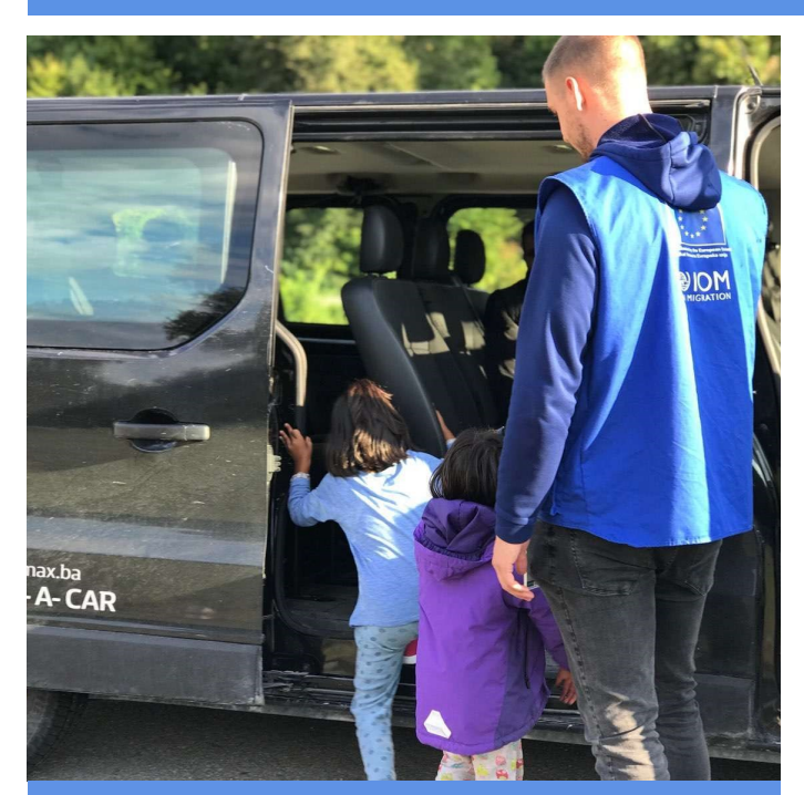
Trasportation service provide to migrants and asylum-seekers in need

IOM has on-call mobile teams available 24/7 for assistance and transportation of migrants, refugees and asylum-seekers. These include transportation for medical cases to hospitals, for children going to school, for vulnerable and injured persons heading to centres identified by outreach teams, for asylum-seekers going to asylum interviews, and for transfers at the request of the SFA.