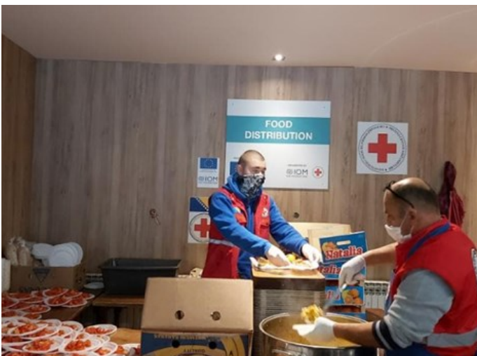
Food distribution in TRC Sedra

Furthermore, in May, the UNFPA BYMC distributed over 1200 drinks and numerous of boxes of dates and biscuits to adolescents and young men participating in regular BYMC activities.