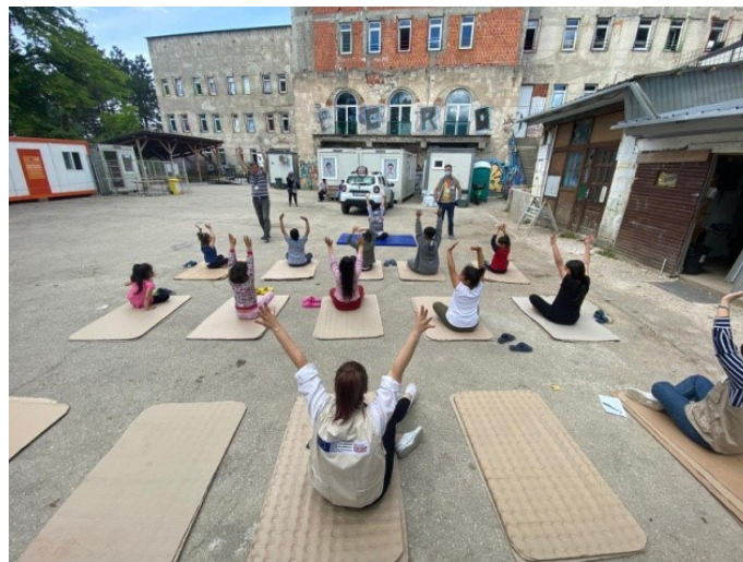
Workshop on prevention of spinal demormities in TRC Borići

In May, 328 children benefitted from health care services provided by UNICEF/DRC paediatric team in TRCs Sedra and Borići, with 296 parents counselled on the health-related topics including immunization. A total of 35 children were vaccinated in TRC Sedra during May.