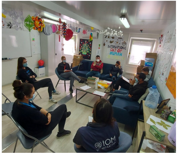
Boys Parliament meeting in TRC Ušivak

IOM encourages beneficiaries in the reception centres to play an active role in decision-making processes and activities. TRCs have Community Representative Councils and regular meetings are organized by IOM with partner agencies. These serve as a platform for discussion of TRC issues, conflict prevention and resolution, dialogues between different beneficiary groups, and between the migrants and TRCs’ management teams. For instance, in TRC Sedra, several meetings took place including the Community Representative and the Boys Parliament meeting, where the representatives were in