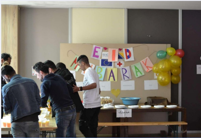
Eid al-Fitr celebrations in TRC Sedra, thanks to SFA and all partner organizations