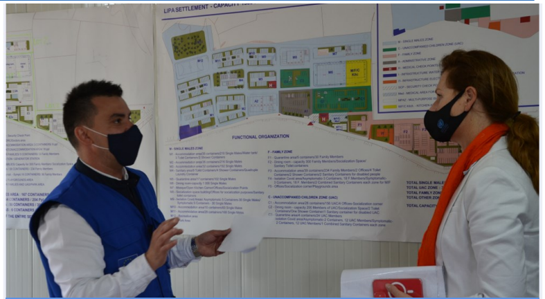
IOM presenting construction plans to UN Resident Coordinator in TRC Lipa