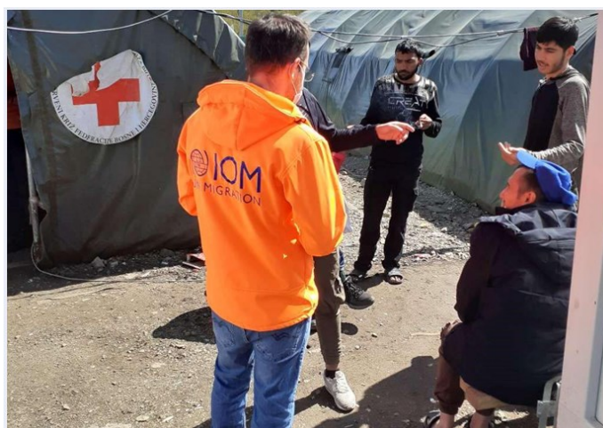
AVRR information sessions in PC Lipa

In May, IOM facilitated the return of 10 migrants (five to Pakistan, two to Afghanistan, one to India, one to Iran, one to Iraq). Furthermore, 2,540 migrants were reached by IOM AVRR