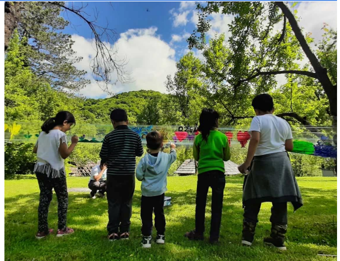
Drawing in the nature workshop in TRC Sedra

In May, SCI regularly provided cultural mediators, Healing and Education Through the Arts (HEART) teachers and school assistants to facilitate obligatory preparatory programme, provide school escorts, help teachers to adjust working materials, and help children with homework and catch-up classes. Moreover, SCI continued to provide technical and operational support to the BiH Ministry of Education and to five local primary schools in USC, to ensure they have the