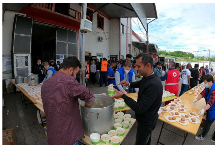
Eid al-Fitr celebrations in TRC Miral