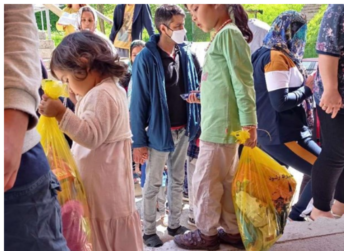
Gift packages distribution for Eid in TRC Ušivak

In TRC Sedra: Strollers and foldable beds to families with children below 1 year of age by IPSIA, and 310 packages for children for the Eid festivity (150 by a private citizen and 160 by Gadzo d.o.o)