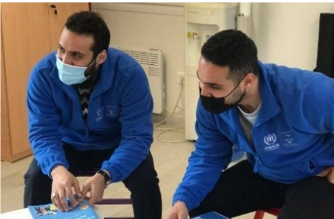
Peer-to-Peer sessions on asylum procedure in BiH in TRC Blažuj and Ušivak facilitated by two brothers from Syria

During the period, four asylum claims were registered by the MoS, Sector for Asylum (SA). 54 asylum claims have been registered so far in 2021, which is a 31 per cent decrease compared to the same period in 2020 (78). At the end of May, 153 people were awaiting registration, and access to asylum continued to be restrictive in BiH, with rates of registration far below those of 2020. Especially for single men in TRCs and persons residing in USC, it remains extremely difficult to register an asylum claim. In this regard, UNHCR's partner Vaša Prava, submitted a complaint to the Human Rights Ombudsman related to access to the asylum procedure for residents of TRC Blažuj, specifically naming four individuals who have been awaiting registration of their asylum claim since 2019. In their response to the Ombudsman, the MoS SA rejected all allegations of unequal and discriminatory treatment towards persons residing in the centre. Vaša Prava responded and a final recommendation by the Ombudsman is