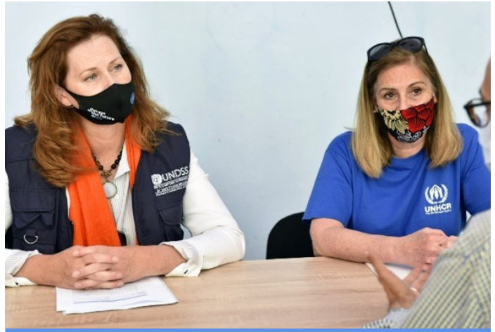
UNRC and UNHCR representative in BiH talking to an asylum-seeker awaiting resolution of his asylum claim in TRC Sedra