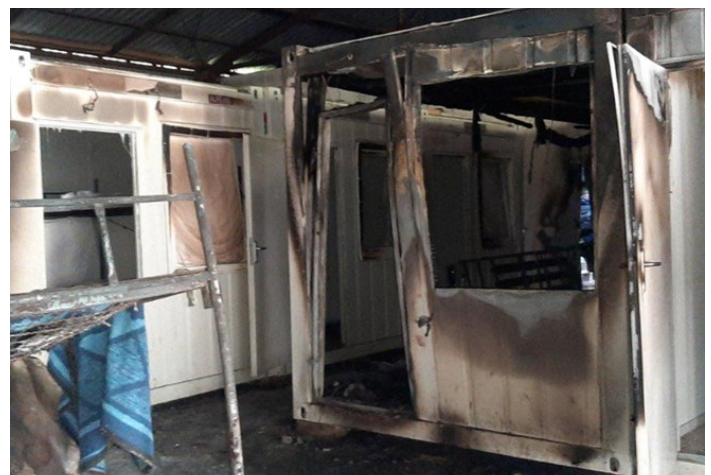
UASC area in TRC Ušivak after the fire

A major incident occurred on 22 May, when a fire broke out in the UASC accommodation unit in TRC Ušivak, due to the malfunctioning of electrical installations. Fortunately, no one was present at the time. Out of 21 accommodation containers placed in the area, five were badly damaged and one completely burnt. What instigated the fire is still unknown, however, IOM is waiting to receive the full report from the specialist who conducted the evaluation.