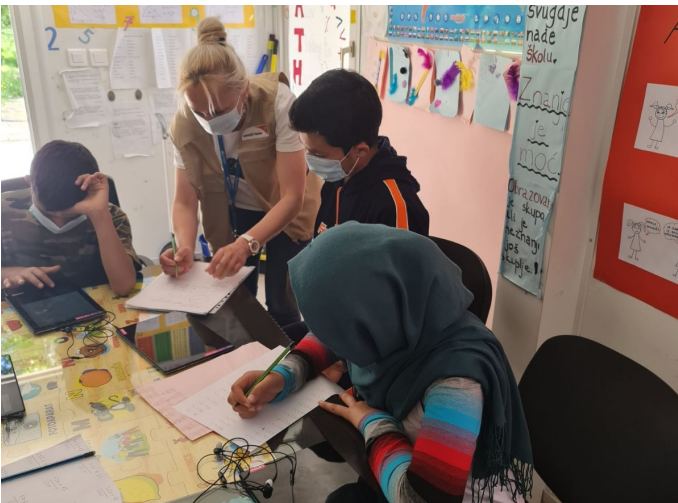
Akelius digital language course in TRC Ušivak

All TRCs marked the Bajram (Eid al-Fitr) festivity with celebrations with tea and snacks that were served on the main plateau by IOM and partner organizations.