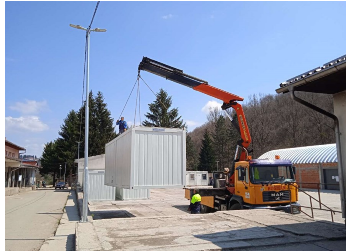
Isolation area in TRC Blazuj

In TRC Blažuj, IOM staff assembled a two-story shelf to best store clean clothes, as there was none before, and installed two electric generators in the laundry room, as there were previously four generators rented from a local contractor. In TRC Borići, on several occasions, IOM maintenance personnel carried out repair work on industrial dryers, as they were not working well. In TRC Sedra, the renovation work on the bathroom of the bungalows (isolation area) was completed