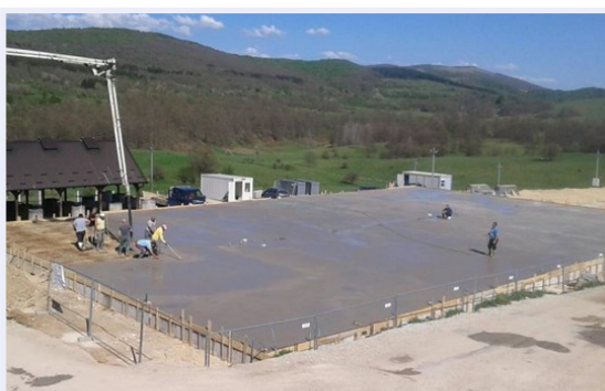
Works on the dining area in TRC Lipa

Several high-level visits also characterized the reporting period. The European Union (EU) Senior Adviser for Migration Management in BiH visited the construction site of Lipa accompanied by the Adviser to the Ministry of Security (MoS) to check and see the works in progress on the new reception facility in USC. Moreover, the United Nations Resident Coordinator (UNRC) to BiH visited USC and TRC Lipa, together with the MoS, IOM and UNHCR representatives. Both visits provided an opportunity to discuss critical questions about assistance to migrants, refugees and asylum-seekers in transit. While in Lipa, IOM presented detailed construction plans for the new TRC and the work in progress. The UNRC also visited TRCs Miral and Sedra, meeting with migrants to share their experiences, challenges, and hopes, as well as with IOM Camp Coordination and Camp Management (CCCM) staff, to exchange information about assistance