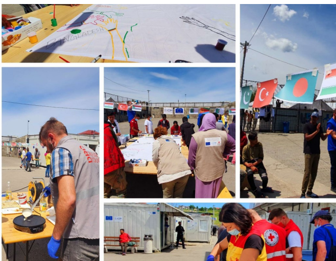
Celebration of Cultural Day of Diversity in TRC Miral

Centre residents can also submit feedback and complaints , or report incidents in person at the info-desks in each TRC, or anonymously in the complaints/feedback boxes. Feedback and complaint committee meetings are regularly organized and were operational in all TRCs during the month of May.