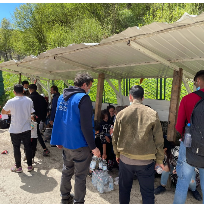
Transportation of new families to TRC Ušivak

IOM has on-call mobile teams available 24/7 for assistance and transportation of migrants, refugees and asylum-seekers. These include transportation for medical cases to hospitals, for children going to school, for vulnerable and injured persons heading to centres identified by outreach teams, for asylum-seekers going to asylum interviews, and for transfers at the request of the SFA.