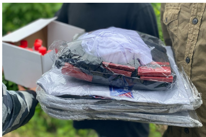
Non-Food Items distribution in outreach

IOM provides NFIs for newly arriving migrants, refugees and asylum-seekers in all TRCs. An NFI distribution system is in place and operational with set schedules displaying distribution times. IOM provides NFI welcome kits, after which individual NFIs refills are provided. NFIs include items such as clothing, footwear, hygiene products, clean bed sheets and linen, or other medical cases as per need. NFIs also include packages to hospitalized migrants, refugees and asylum-seekers which contains pyjamas, slippers, a towel and other items necessary for hospital stays. Specially prepared baby packages and other items are available based on needs. All new arrivals in pre-registration or in isolation are provided with hygiene packages (including soap, shampoo, shower gel, toilet paper, tissues) as well as clothes when needed. In May, IOM distributed a total of 50,802 individual items to 3,370 persons. Furthermore, through the Centres for Women and Girls (WGC) and Boys and Young Men Centres (BYMC) , UNFPA continued to distribute modern contraceptives and hygienic products. In May, UNFPA distributed 183 dignity kits and 139 contraceptives for women. In addition, 18 dignity kits for adolescent boys, and around 232 condoms were distributed through Centres for Boys and Young men.