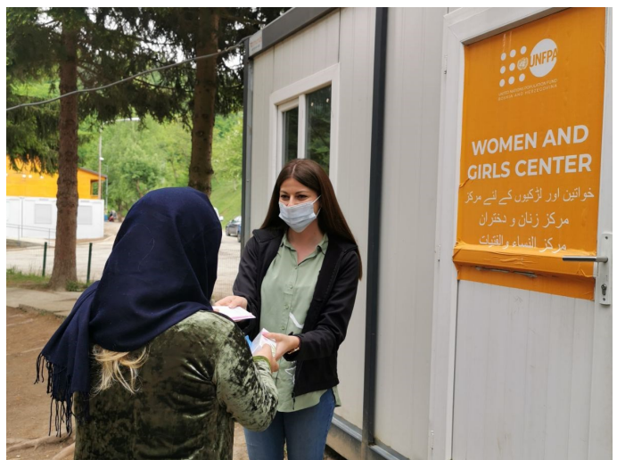
Distribution of menstrual hygiene products

UNICEF, in partnership with MDM, continued to provide MHPSS for UASC and children in families in TRCs in USC