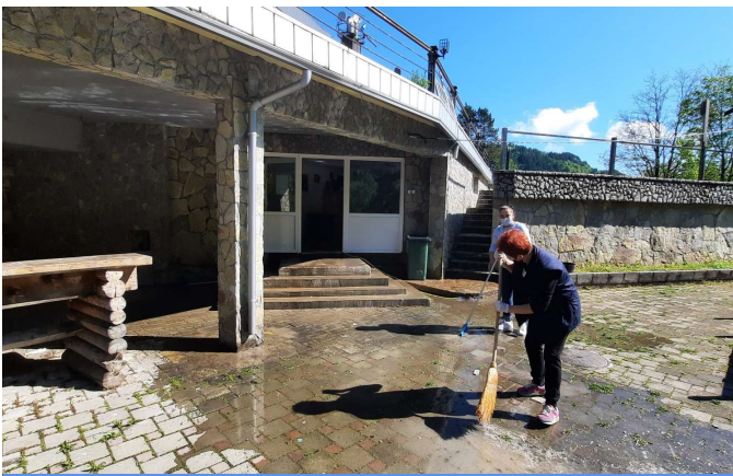
WASH activities in TRC Sedra

IOM continues to support all TRCs in USC with vector and pest control activities. Disinfections are organized weekly, while disinfections take place monthly, and deratization take place every three months.