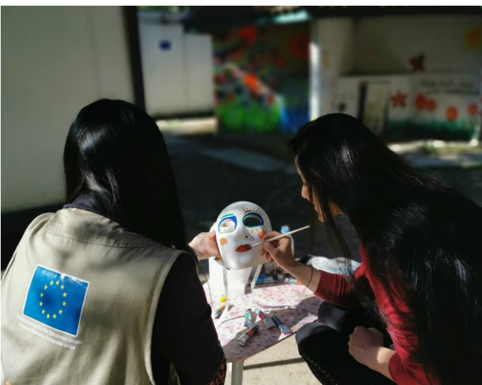
Empowerment activities with women

Restriction of movement to enter the USC and the ban on use of public transportation for migrants and asylum-seekers