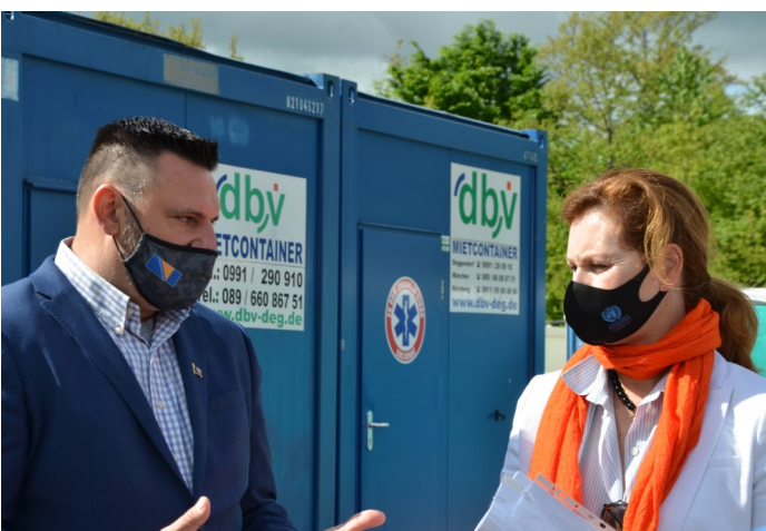
Work on the dining area at the new site TRC Lipa

Lastly, the Smart Camp management system, which is jointly implemented by IOM and SFA, was launched in May and is currently in its pilot phase in all the TRCs. This is a new application to collect basic information about migrants hosted in the centres in BiH, including personal information, vulnerability, legal status, registration date, etc. The system was also set up to help IOM, SFA and partner agencies to improve coordination between both partners and centres and, to provide better assistance services and at the same time collect data in a more harmonious and systematic way. The training courses were gradually conducted for all IOM and SFA staff. During the month of June, the IOM plans to organize training courses for partner agencies for its full implementation.