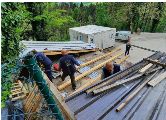
Work on refurbishment of the roof in TRC Borici

TRC Blažuj (opened in December 2019) Several works conducted by contractors were finalized: works for laying the concrete in front of the new isolation area and sanitary building (H14) to prevent the accumulation of water, as well as works to improve the Wi-Fi connection for migrants with the installation of three new antennas by BH Telecom. Other works included the excavation of a temporary channel from the sanitary container (H14) to the nearest sewer well to avoid the collection of water in front of it; the installation of two junc-