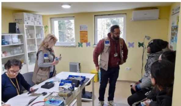
Provision of health services to beneficiaries @DRC 2024