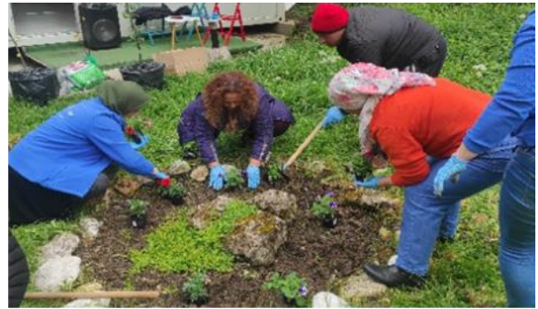
Asylum-seekers and BHVI team planting trees and flower seedlings to mark Earth Day in TRC Ušivak