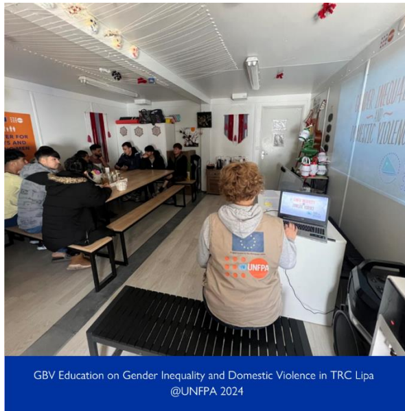
GBV Education on Gender Inequality and Domestic Violence in TRC Lipa @UNFPA 2024

In April, UNFPA organized an introductory training session on Gender-based violence for the staff of the Institute of Public Health of Una Sana Canton therewith supporting the transition of medical screening services making sure that relevant staff is equipped with the necessary knowledge and skills to effectively recognize and address Gender-based violence.