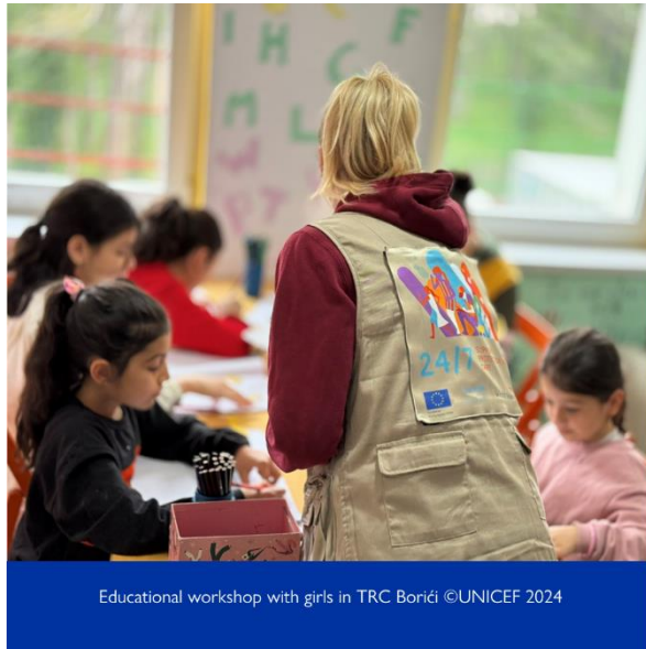
Educational workshop with girls in TRC Borići

In partnership with Fenix in TRC Borići and World Vision in TRC Ušivak 45 children (21 girls and 24 boys) and 59 parents and 6 pregnant women were reached with infant and young child feeding (IYCF) services. In April, pediatric nurses were focused on activities and workshops with the aim of empowering parents for the challenges that parenthood brings, workshops aimed at educating parents on child development and creating healthy habits.