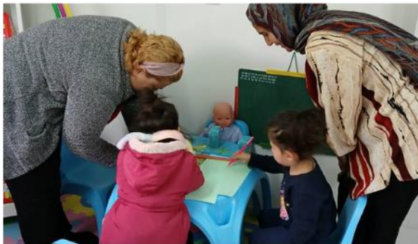
Mothers with toddlers in the Mother and Baby Unit