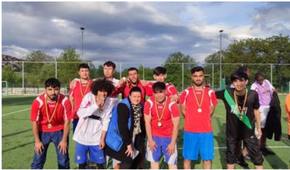
Organization of a football tournament in cooperation with FC Respekt @IOM 2024