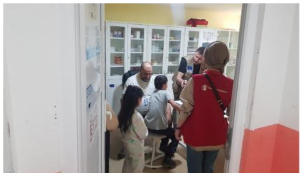
Regular weekly medical checkups for children enrolled in the preparatory school program @SCI 2024