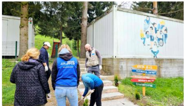
Planting trees to commemorate the International Earth Day in TRC Ušivak @UNFPA 2024