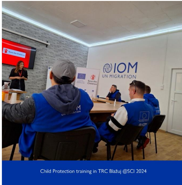
Child Protection training in TRC Blažuj @SCI 2024