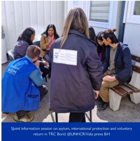
Joint information session on asylum, international protection and voluntary return in TRC Borići

UNHCR and its partner Vaša prava BiH organized, partially together with IOM, group and individual information sessions on the asylum procedure and international protection in BiH for 343 persons. Majority of the participants were from the Syrian Arab Republic, Afghanistan and Morocco. Vaša prava BiH noted increased interest in free legal aid related to the asylum procedure from people detained in the Immigration Centre as well as in state prison in Vojkovići. These detention and extradition-related cases require specific treatment due to their sensitivity and complexity.