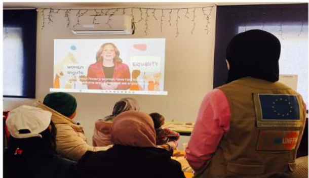
Celebrating International Women's Day in TRC Ušivak @UNFPA 2024