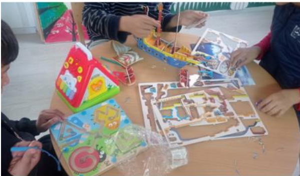
Child Friendly Space activity in TRC Borici @UNICEF 2024