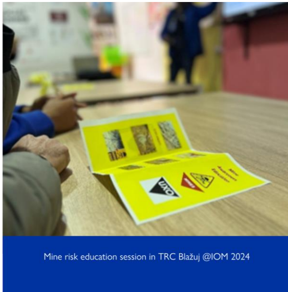
Mine risk education session in TRC Blažuj @IOM 2024