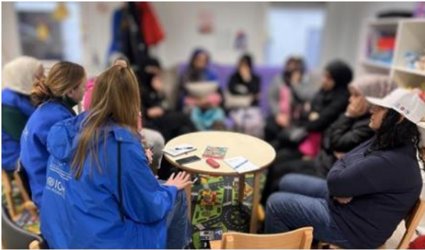
"Women's Dialogues" focus group in TRC Ušivak @IOM 2024