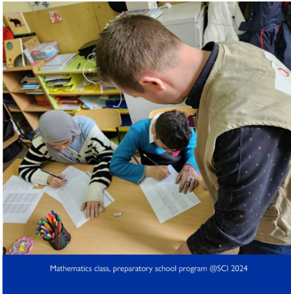
Mathematics class, preparatory school program

Save the Children's child protection teams continue to play a crucial role in identifying UASC and other vulnerable cases, referring them to appropriate services, and delivering vital child-protection information. In March, outreach teams reached 54 potential UASC, including one girl, which is a 22% decline compared to the previous month. Among 27 families identified in transit in Una-Sana Canton (USC), 15 families were from Türkiye, which is an increased trend. Concerningly, 53 refugees and migrants were reported to have been pushed back from Croatia, of which 19 were UASC. 34% of potential UASC identified in USC reported that they were not registered before in BiH. Appropriate and timely registration is the first step in ensuring adequate protection for children and other vulnerable cases.