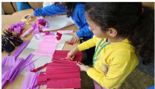
Creative workshop, preparatory school program @SCI 2024