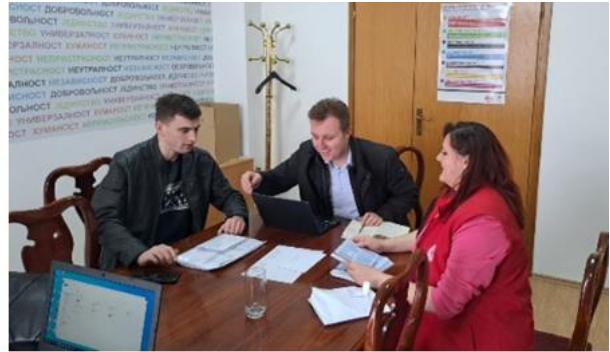
Handover of vouchers for Ukrainians in BiH, from CRS to Red Cross partners, ahead of the distribution