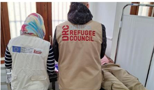
Provision of health services to beneficiaries @DRC 2024