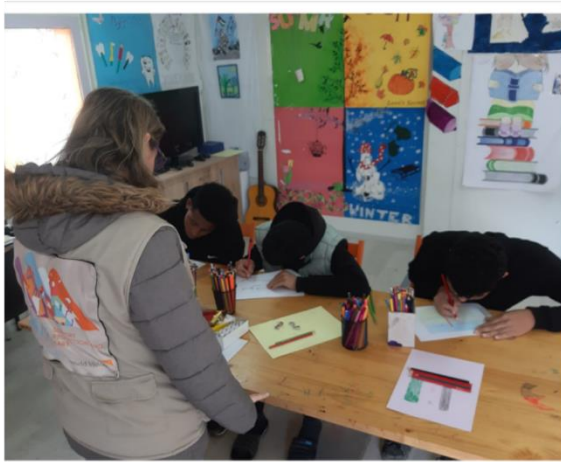
Gender-based violence workshop in TRC Ušivak

In partnership with Fenix in TRC Borići and World Vision in TRC Ušivak 33 children (18 girls and 15 boys) and 35 parents, out of which three pregnant women, were reached with infant and young child feeding (IYCF) services . In March, pediatric nurses were focused on activities and workshops with aim of empowering parents for the challenges that parenthood brings, workshops aimed at educating parents on child development and creating healthy habits and daily individual consultations and support for parents and children.