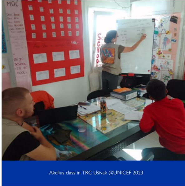
Akelius class in TRC Ušivak

In partnership with local NGO Fenix in TRC Borići and World Vision in TRC Ušivak 39 children (14 girls and 25 boys) and 29 parents out of which 8 pregnant women were reached with infant and young child feeding (IYCF) services with the aim of empowering mothers to connect with their children and build healthy habits in children. In July, the MBU Pediatric Nurses held an educational workshop on pregnancy, breastfeeding, nutrition for babies and personal hygiene.