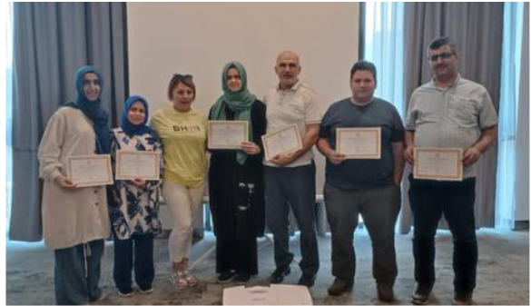
Awarding of diploma for students who successfully passed a B/C/S language exam @UNHCR's partner BHWI 2023