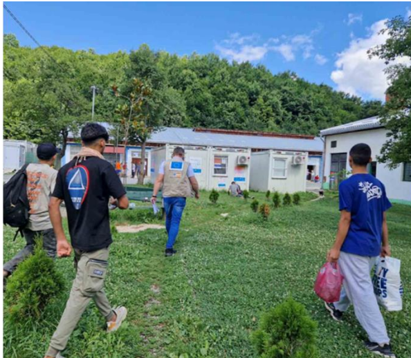
Protection sensitive services and accommodation provision to vulnerable young men within the Green Zone @UNFPA 2023

Throughout July, UNFPA in cooperation with SFA/IOM continued the implementation of the Green zone mechanisms in TRC Lipa and TRC Blazuj, ensuring safety and prevention of violence through adequate accommodation of young men, regular monitoring and proximity to relevant services. During the reporting month, UNFPA supported 366 young men with adequate protection-oriented accommodation and services in the Green Zones.