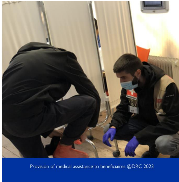
Provision of medical assistance to beneficiaries @DRC 2023

During the month of July, DRC Medical teams performed more than 6000 medical screenings for the new arrivals in the TRC BiH. When looking at the previous period, medical screenings have increased by more than 30% when compared to June. New arrivals are arriving in larger numbers during the weekends, which puts more pressure on DRC teams on Monday when many screenings are performed.