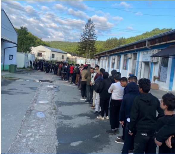
Registration of new beneficiaries in TRC Blažuj @IOM 2023