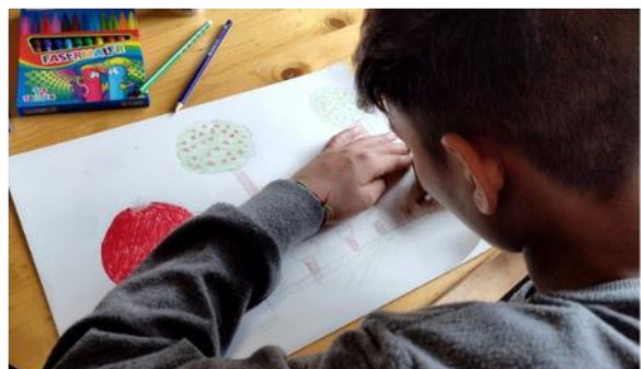
Psychosocial Support activities for potential UASC in TRC Blažuj @SCI 2023