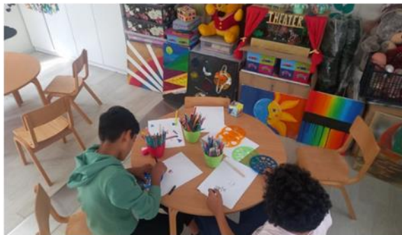
Child-Friendly Schools activity in TRC Borići