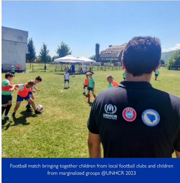
Football match bringing together children from local football clubs and children from marginalized groups

In Bihać, activities for social integration through football were organized by UNHCR with the National Football Association of BiH, supported by the UEFA. The football game gathered 80 children from local clubs and children from vulnerable groups, including from refugee, asylum-seeking, and migrant families, from Roma communities, etc. The Football3 methodology was applied, where players collectively decide on the rules before the game. As Football3 is played without referees, players learn how to resolve conflicts themselves through dialogue. To foster sustainability, coaches in football associations and physical education teachers from elementary schools were trained on the methodology.