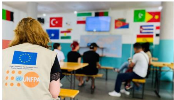
Joint UNFPA/MdM group session on improving parenting skills in TRC Borići @UNFPA 2023