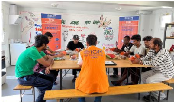
Assisted Voluntary Return and Reintegration counselling session in TRC Lipa