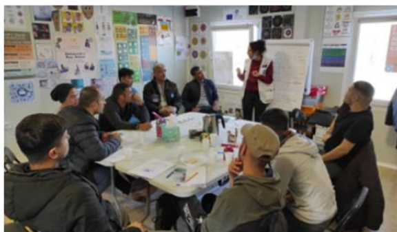
Psychoeducational group sessions on mental health awareness @MdM 2023 (DRC partner)