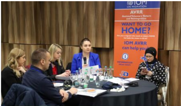
IOM training for BiH migration practitioners on rights-based approach to return counselling