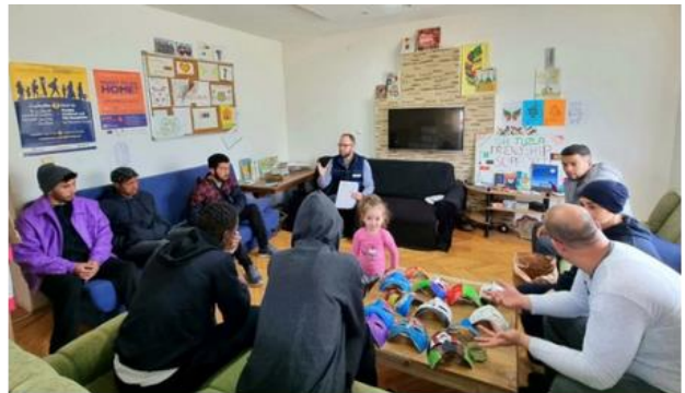
Focus group discussion on the asylum procedure in BiH at the Puž House in Tuzla