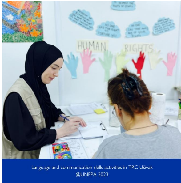
Language and communication skills activities in TRC Ušivak @UNFPA 2023

During April, majority of identified cases of GBV reported experiences of psychological/emotional violence, followed by economic violence, and forced marriages with several cases of female genital mutilation and sexual violence. Due to the nature of identified types of violence which survivors reported being exposed to during movement or in the country of origin, supportive GBV services were provided to meet the needs of beneficiaries.