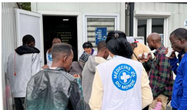
World Health Day Celebration @DRC partner MdM 2023