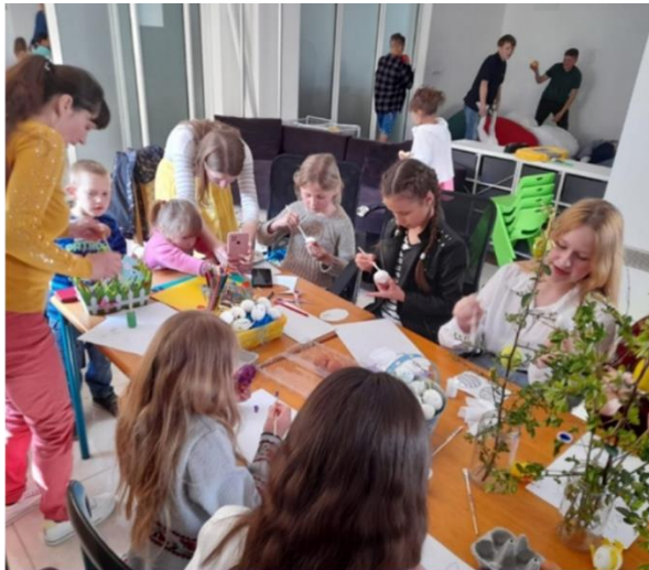
Art therapy workshop attended by refugees from Ukraine

Some 300 persons provided with information related to asylum in BiH