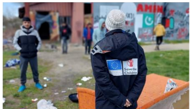
SCI Outreach activities in Velika Kladuša @SCI 2023