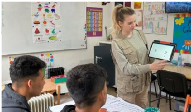
Non-formal educational activity using the Akelius digital language course @UNICEF 2023