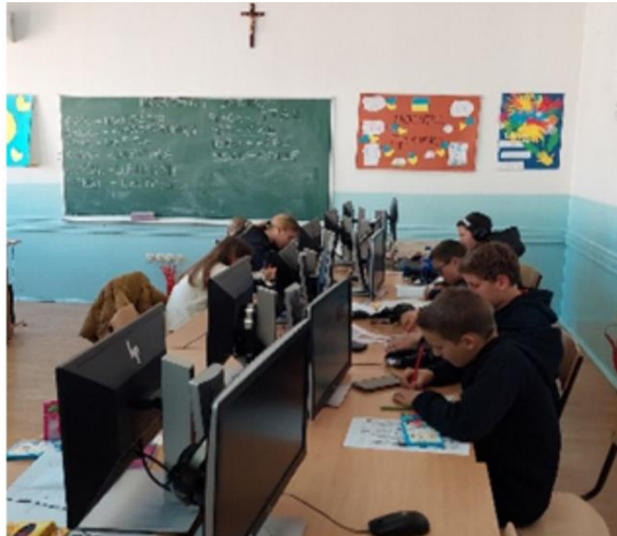
Primary school in Medugorje, Ukrainian children using distance learning platforms