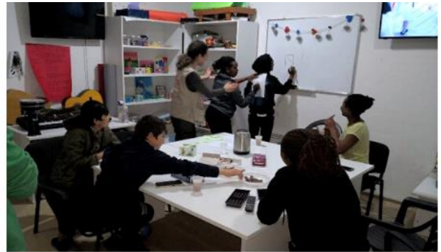
UNICEF/WV MHPSS and workshops organized with beneficiaries in TRCs