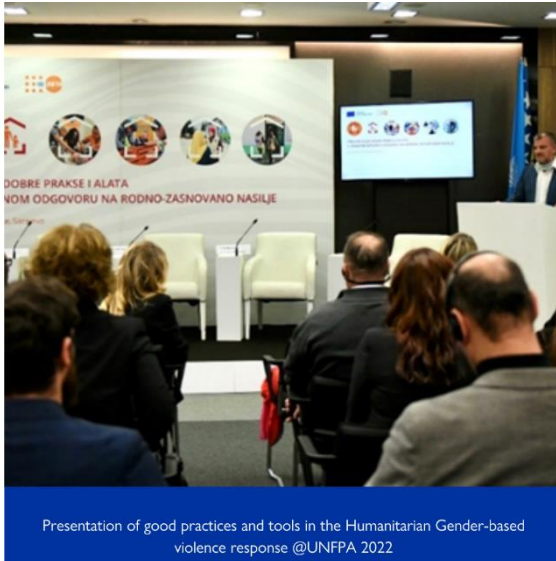
Presentation of good practices and tools in the Humanitarian Gender-based violence response @UNFPA 2022

UNFPA with support of EU organized the “Presentation of good practices and tools in the Humanitarian Gender-Based Violence Response” event, which gathered representatives of governmental institutions, healthcare providers, humanitarian agencies, civil society organizations, and other institutions in Bosnia and Herzegovina, to learn about the good practices and tools in the humanitarian Gender Based Violence (GBV) response.