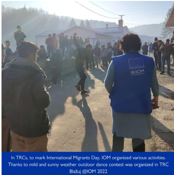
In TRCs, to mark International Migrants Day, IOM organized various activities. Thanks to mild and sunny weather outdoor dance contest was organized in TRC Blažuj @IOM 2022