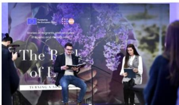
Promotion of "The Book of Life, stories of migrants and refugees in the humanitarian response" @UNFPA 2022