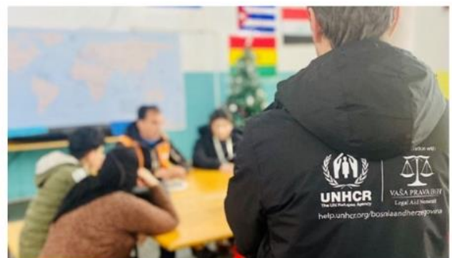
Joint IOM – UNHCR/Vaša prava BiH info session in TRC Borići