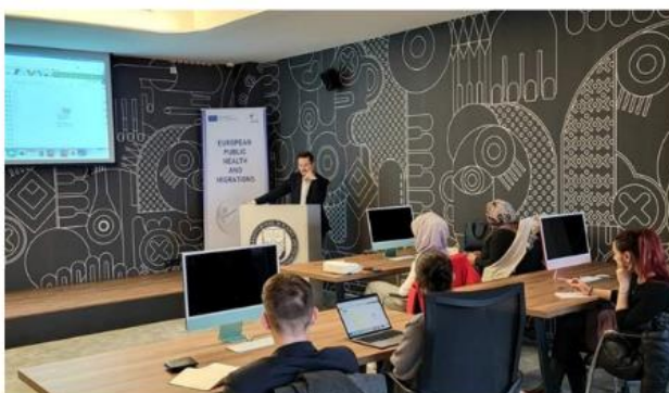
European Union Public Health and Migration (EUPHAM) stakeholder workshop @DRC 2022