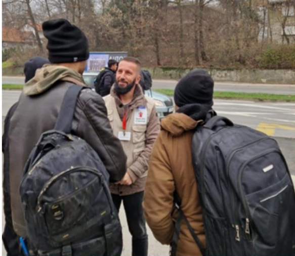
NFI support and information sharing to newly arrived potential UASC in Tuzla Canton

Save the Children in coordination with institutions, as well in partnership with Cantonal Center for Social Welfare Sarajevo and Center for Social Welfare Velika Kladuša continues to support unaccompanied and separated children outside of reception centers.