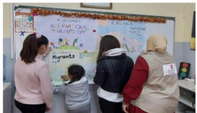
Joint educational-creative workshops for children on the move and children from local elementary schools @SCI 2022